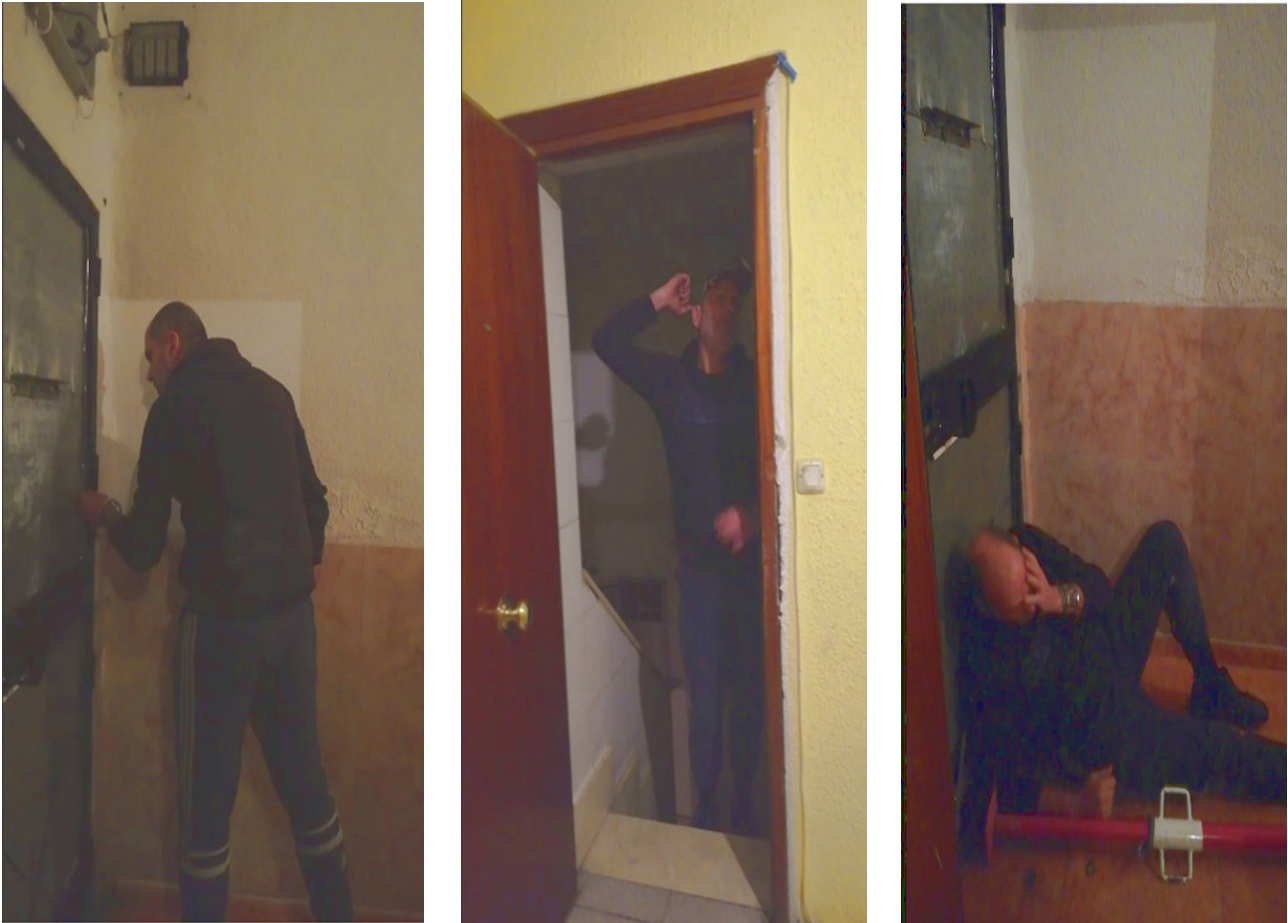
Figure 1. Role playing by a the survivor of the circumstances of the aggression by police officers as part of the forensic assessment.

The Role-Playing had the double purpose of (a) sustaining the report by mapping circumstantial elements and (b) doing a prolonged therapeutic intervention by clarification and working with emotions of sadness and guilt.