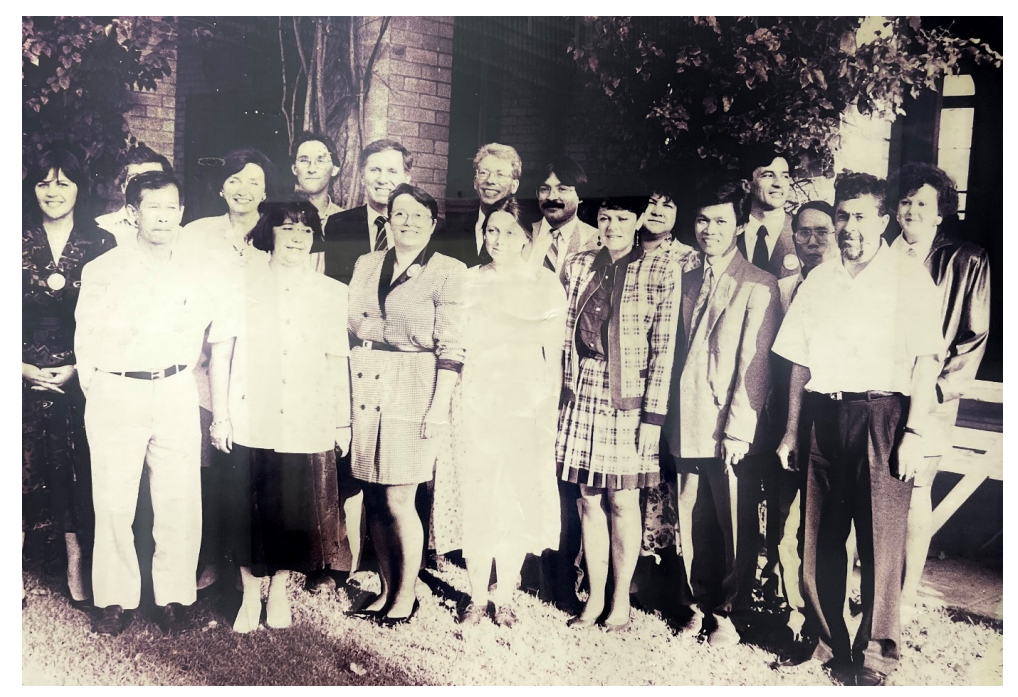
STARTTS colleagues (1990/91).

The conceptual framework proposed in this pioneering article guided STARTTS service provision philosophy through these tumultuous times and enabled the service to adapt, evolve and grow without compromising the key elements that make it effective and relevant to our clients and their communities.