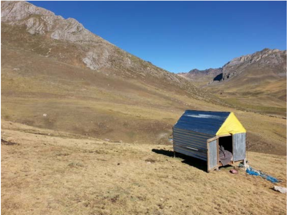
Photograph 3: Contemporary bedroom of house in Santa Barbara