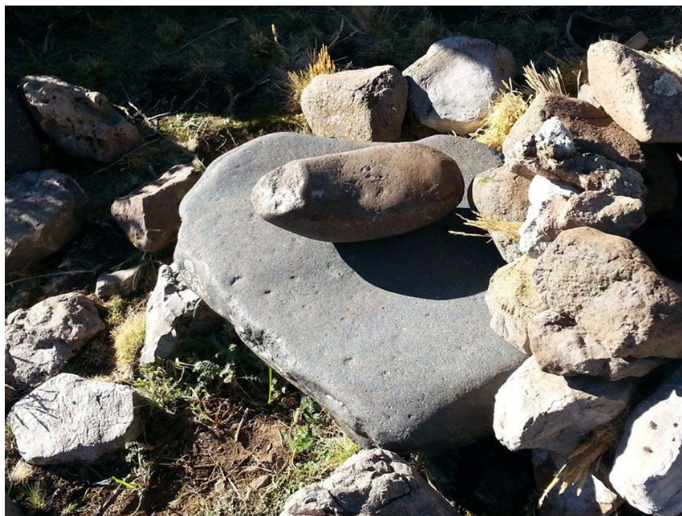
Photograph 4: Remains of cooking materials made of stone “Mortero”