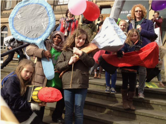
Standing on the Art Gallery steps en route to the Freedom Bin burning

evident in our everyday encounters. The women are also a transient group, and joining the project gives them a feeling of connection, support and friendship as well as extra material to use as evidence in their claims for asylum – a commitment to take part in the city. This is an invitation to engage in a celebratory act of solidarity made safe by the university and student group organising it. Wearing capes and customised t-shirts made while part of the group, the women proudly voice their love for Rainbow Hearts, the essential support it gives them and the vital friendships they have made with each other.