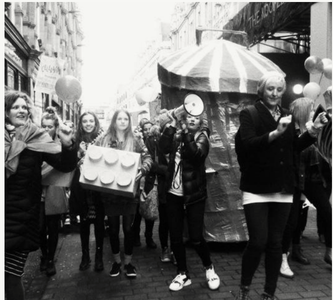
International Women's Day Walks 2014 featuring a Giant Bra & 2015 the Freedom Bin

In 2014 we carried a giant bra, in 2015 a giant Freedom Bin. Both of these objects refer to the 1968 Miss American Pageant protests, where women were reputedly burning bras in a trashcan. The burning bra became a symbol of feminism of the 1970s that then became used for different arguments in pro and anti feminist actions.