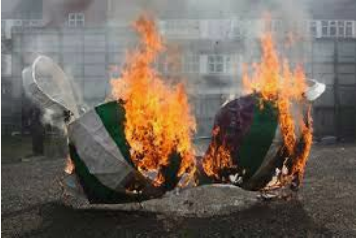
The Burning of the Bra 2014

We decided to claim these symbols for contemporary action, while at the same time recognising their absurdity and their iconic inferences. This deliberate cartoonish approach created issues within the academy and revealed unexpected anxieties around aesthetics and art from other colleagues. It made visible continuing ideologies of high and low culture that perpetuate the separation of art and life, academy and public that hinders meaningful transdisciplinary activity.