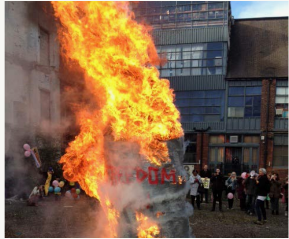
The Burning of the Freedom Bin 2015

Having walked through the centre of Leeds, each Walk finished at a derelict piece of land behind The Gallery, Munro House. Using iconic symbolism and ritual to complete the event through the burning of the objects, this allows for a transformative experience for all participants. This playful transformation embeds the experience in each of us and as a group, but also creates a feeling of renewal and of the future.