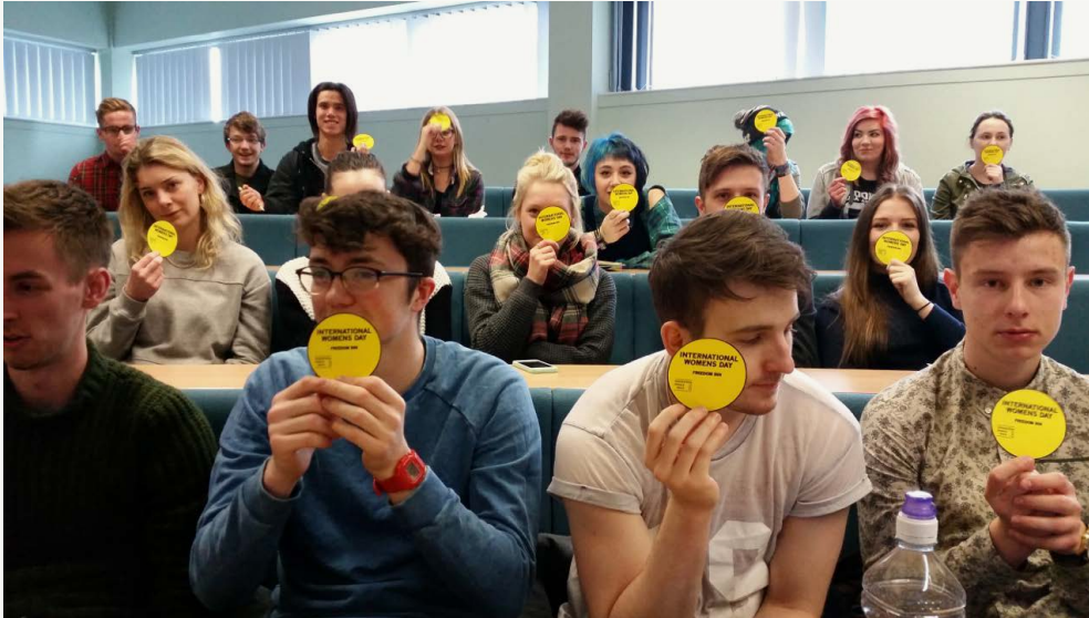
Freedom Bin stickers in Lecture Theatre 222

Students and the public were invited to join the project, add their views and name their objects of imposition. Here the lecture theatre was turned into a participatory space in which to promote the Women's Day project through dialogue and invitation to act. Aware of our position of 'authority in this academic setting we were able to ask everyone to take part in an action and see the potential of subverting the assumed formal set-up, transforming it from a 'passive' learning environment into a moment of participation.