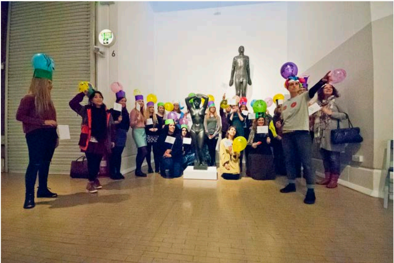
Performing adorned with balloons in Leeds Art Gallery Sculpture Galleries 2015

'People need not only to obtain things, they need above all the freedom to make things among which they can live, to give shape to them according to their own tastes, and to put them to use in caring for and about others.'... Conviviality is therefore about having the power to shape one's own world. ...'I consider conviviality to be individual freedom realised in personal interdependence and, as such, an intrinsic ethical value. I believe that, in any society, as conviviality is reduced below a certain level, no amount of industrial productivity can effectively satisfy the needs it creates among society's members.'