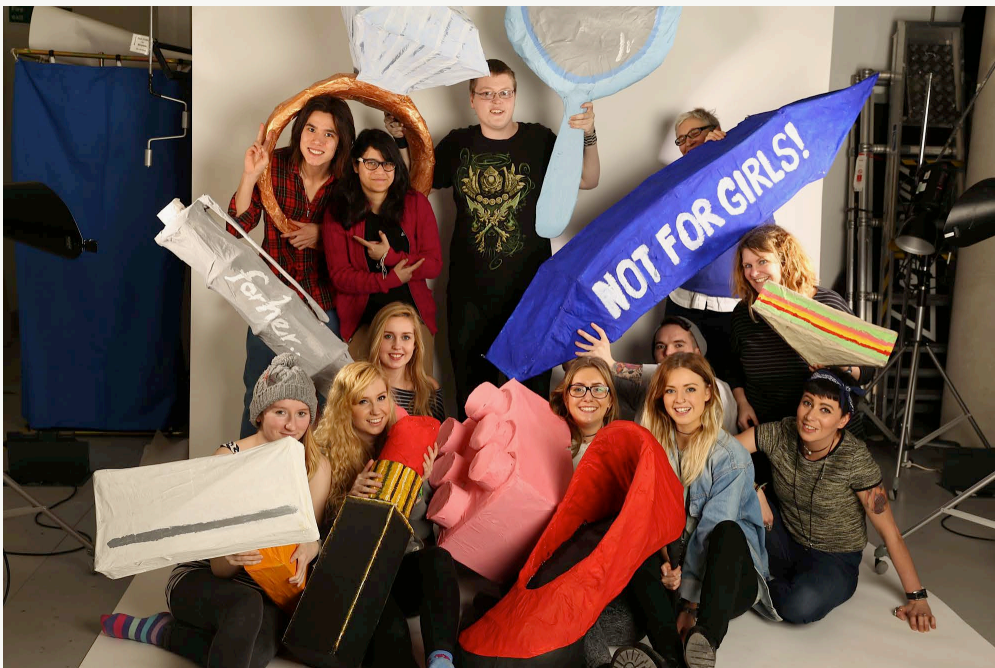
Objects of Imposition

We drew in response to the radio content on the wall with felt-tips, overlapping and sharing pen lines, space and symbols to make visible and humorously represent misogynistic viewpoints, fixed images of women and surrounding taboos. Stuart Brown talks about the positive nature of play to produce a more flexible mind, which therefore offers more possibilities. Initially unsure of this unfamiliar format, the students gradually immersed themselves alongside us, and the resulting, surprising montage of material offered permission to laugh at an issue that many students initially felt they could only discuss if they were already historically and theoretically well-informed.