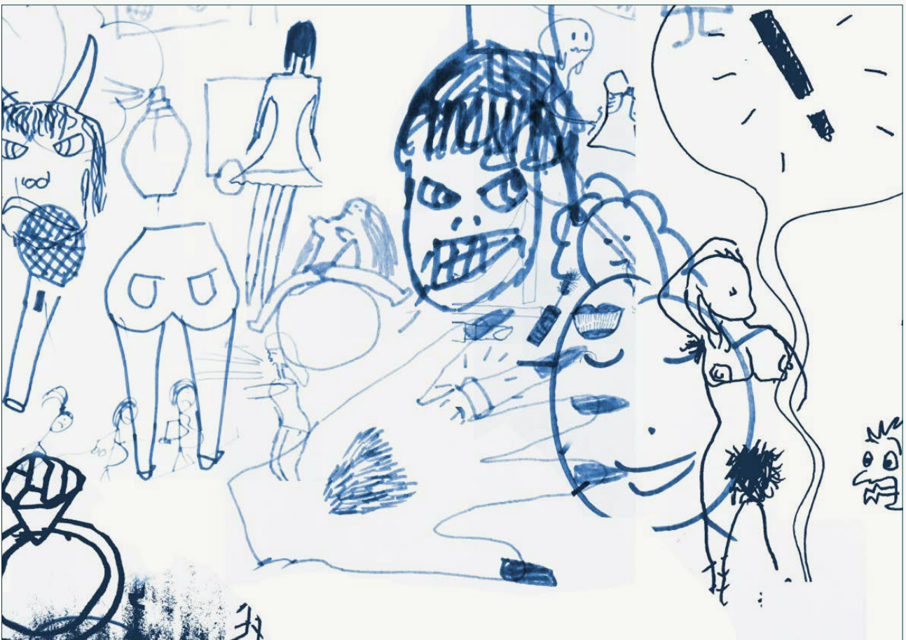
Introducing the International Women's day project to students

We ask students to take risks, much as a young child does in play, as it is only through risky endeavour that we can discover more about ourselves. Students will take risks particularly when they feel the lecturers are risking something too. The cliché of 'being in it together' is apt here. Being in it together also enables the process of collaboration and sharing ideas to be more effective, when we play together we move between our own ideas and actions and others involved, ideas can be taken up, changed and discarded. Taking part invites connection, and value is placed on collective and individual contributions.