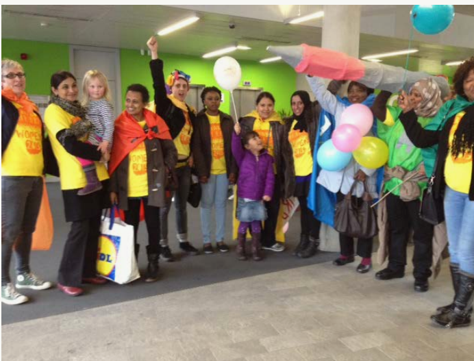
Rainbow Hearts Women Asylum Seekers gather together before the Walk 2015

The Public enter the academy; the students enter the public sphere.