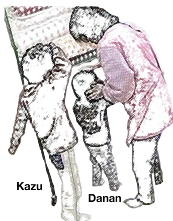
Fig.3 04 TEA: | (°shooganai ne°) | cannot.be.helped PP | It can't be helped/It is what it is. tea | keeps both hands on DAN's head, but stop rubbing kazu | hand on own forehead-----> 05 DAN: | A::::AH::::::::::EN:::::::::: 06 | °en:|:::::° tea | crouches down to DAN's eye level 07 TEA: | a >gomen gomen< | ah sorry sorry | Ah, sorry sorry. tea | starts again rubbing back of DAN's head kazu | hand on own forehead----->

01 DAN: WAH:: | A:: AH:::::::::: 02 TEA: | ( ) 03 | #futari tomo | itakatta n da tte. | two.people both hurt-PST NMZ COP QT | He says both of you got hurt ( ) . tea | both hands on DAN's head, rubs back of DAN's head with L hand fig | #3 dan | kazu | takes hand off of his forehead | hands on own head----->