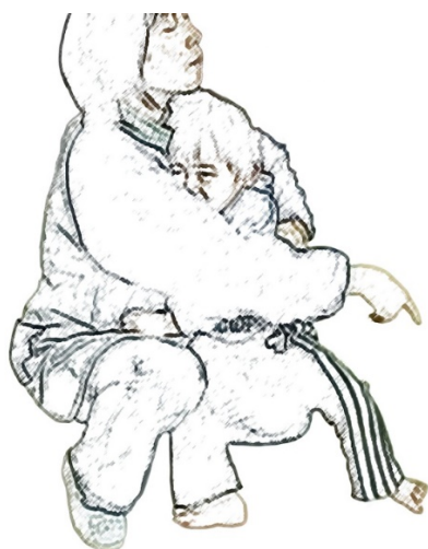
Fig.5 tea -----> adjusts REO's leg REO: °(a:::) TEA: |>nakanaide.< cry-NEG Don't cry. tea -----> |touches REO's arm

Teacher-other child (C-2) interaction gazing towards C-2 C-2 |#MO ↑SUWATETE KUDASAI! NAME too sit-ASP-TE please C-2 too please sit down! C-2 off camera |points to floor #5