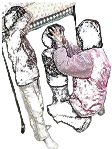
Fig. 4 10 DAN: |EN:.....|:AH:..... 11 TEA: |>daijobu daijobu< fine fine You're fine You're fine. tea rubbing-----→ kaz rubbing his eyes

08 DAN: |.hhh |EN:..... 09 TEA: |#doko ita|katta no?= where hurt-PST NMZ Where did it hurt? tea |rubbing DAN's head and forehead→ kaz |moves hand to face-----→ fig |#4