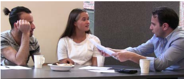
Figure 1: The change in posture and facial expression related to change-of-state.