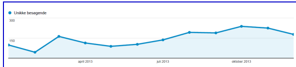
FIGURE 1. No. of unique visitors to the SJCAPP homepage (11/2012-12/2013) [Google Analytics]

We are now entering the second year of the Scandinavian Journal of Child and Adolescent Psychiatry and Psychology (SJCAPP). A look at the web-statistics demonstrates a steady increase in the number of visitors to our journal. Figure 1 shows the number of unique SJCAPP site visitors per month since the journals launch in November 2012. Many visitors use the SJCAPP site regularly, so the total number of monthly visitors is significantly higher.