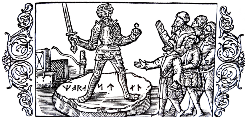
Figure 1. Olaus Magnus. Mora Stone. (Olaus Magnus Historia de gentibus Septentrionalibus . Farnborough 1971).

from its original place (quoted and paraphrased in Holmgren 1954, 14–22). The monarchs Gustav Vasa (r. 1523-1560) and Johan III (r. 1569-1592) had to search for the stone, but it could not be found. In Olaus Magnus’s 1555 work Historia De Gentibus Septentrionalibus , mention is made of a large flat rock, surrounded by twelve smaller stones, which had allegedly been called the Mora Stone since ancient times. 10 A woodcut included in the work shows how a king, standing on the stone, is praised by the common people (see fig. 1). However, this description is not based on an eyewitness account, nor is the Austrian diplomat Erich Lassota von Steblaus’s information from 1593 that the Mora Stone was “ein Weisser Stein” (a white stone; quoted in Holmgren 1954, 3).