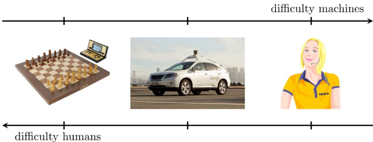
Figure 1: For many types of tasks, the axis of difficulty for machines is opposite the one for humans.

Modern computers are however much more easily overwhelmed by problems in which the rules or the goal – or both – are less clearly formulated and delimited. One such example is driverless cars. As in chess, there are also rules to obey in traffic, but there are many more rules than in chess, and they are much less formally specifiable. It is even more complicated for computers to successfully small talk with a human for a few minutes over a cup of coffee. Chatbots are computer systems for engaging in dialogue with humans, and the dialogue can either be in writing or through a voice interface. Building a chatbot that can engage successfully in small talk with humans is exceptionally difficult, as the rules of such dialogues are even much less clear than the rules in traffic. This is also why a lot of the chatbot technology that