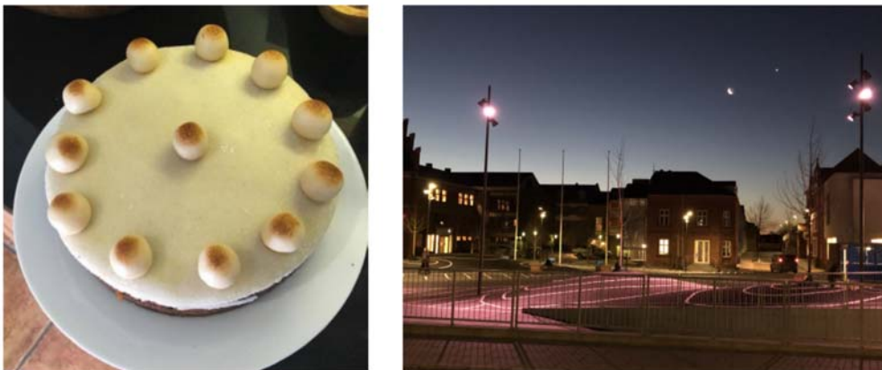
Figure 3: Two pictures that were blocked by the image recognition system of Instagram and claimed by the algorithm to contain unacceptable nudity or pornographic content.

The drawback of the connectionist approach is, however, that it can never be 100% predictable, error-free or explainable. The systems built according to this approach are based on statistical learning from experience. When you do statistical learning from experience, your ability to correctly categorise new objects, for instance recognise certain types of pictures, gradually improves but can never become 100% precise. An example of this is the two pictures in Figure 3. They don't seem to bear many similarities, and they seem to be fairly acceptable pictures from everyday situations. However, they were both blocked by the image recognition system of Instagram (in 2015 and 2019, respectively), and both were claimed by the system to contain unacceptable nudity. There is currently no way of knowing exactly why these pictures were labelled as unacceptable, as the neural networks train an implicit model with millions of neuron weights, and it is the combination of all these neuron weights that decide the classification the network makes. There is also no simple way of telling the neural network that easter simnel cakes like the one on the left in Figure 3 are not examples of nudity. The only way to try avoiding such misclassifications in the future is to provide the algorithm with more labelled