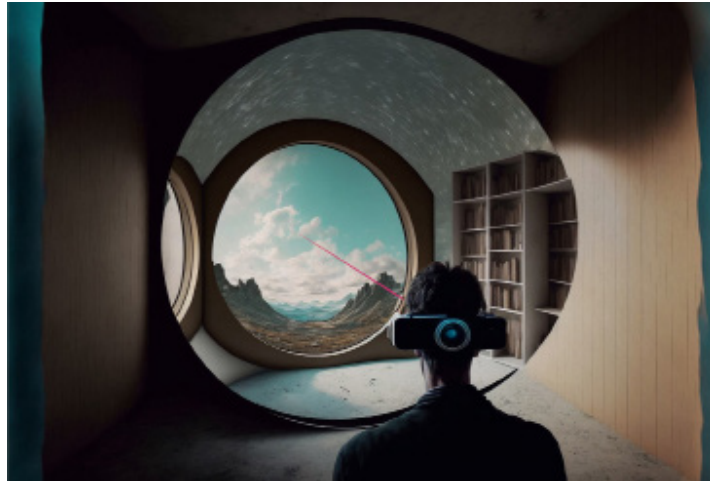
Figure 6 Coloured Tendrils

Thus, in the context of eye-tracking, if future empirical studies could design, test, and apply FBA to increase awareness of eye-tracking, it could be an effective application of visceral notice. Regardless of the specific design feature, the goal is to stimulate lasting psychological responses to communicate to users that they are being monitored and tracked.