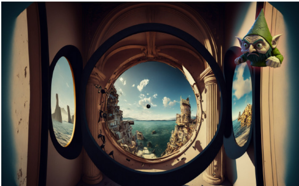
(Figure 5) Creepy Gnome