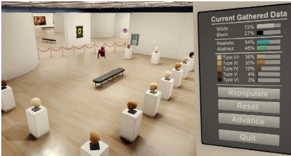
(Figure 3) Art Gallery

users to consider whether companies should have the power over this information and increase awareness of the privacy risks in VR.