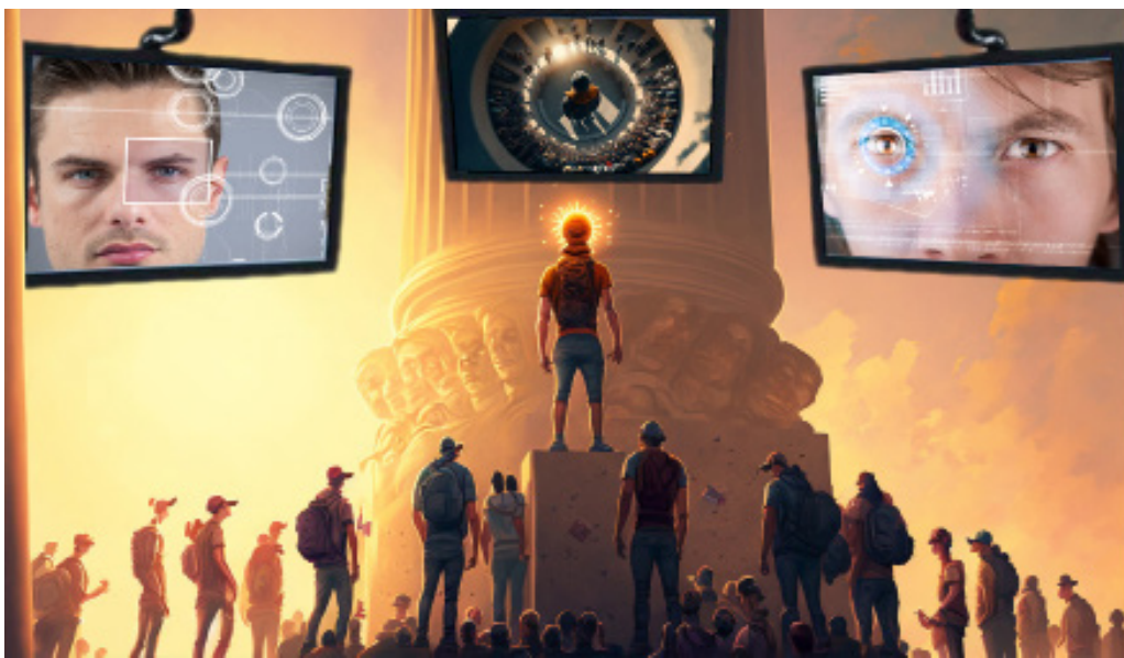
(Figure 2) Raised Pillar

Our first suggestion is to have users viscerally confront the meaning of their eyes being tracked in the privacy training module described previously. In a potential immersive VR privacy module, users might find themselves standing on a pillar raised hundreds of feet. Beneath them, a crowd of people are looking at them, and before them are large TV screens, suspended in the air which are all recording and playing the users’ current movements. After a short interval of this disorientating experience, the screen could present to the user relevant data and analytics concerning the scenario in the privacy module.