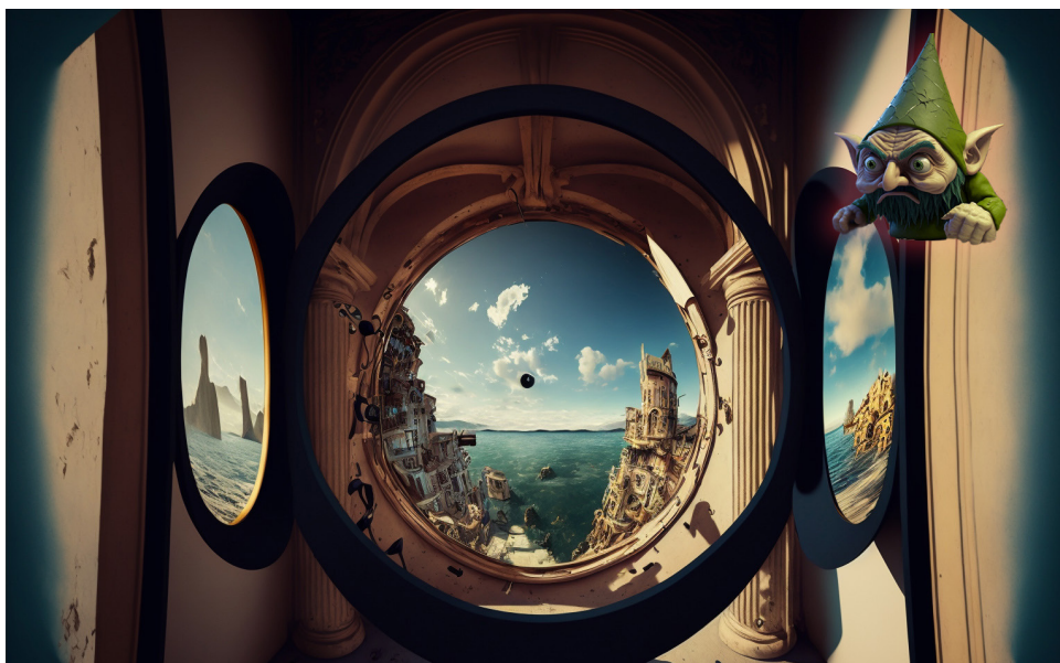
Figure 5 Creepy Gnome

One anthropomorphic cue that Calo suggests is to have a little avatar run across the screen when they click on new websites. 74 Since seeing a physical manifestation of being followed is presumably uncomfortable, it can help the user to become more viscerally aware of tracking and take it more seriously than if the notice was a wall of boring text. For another example, imagine a little green gnomish figure tucked into the top right-hand corner of a computer screen. It has bulging eyes (to signify eye-tracking), and stares intensely at users, always meeting their gaze directly. It might also occasionally blink or tap the foot slightly to attract users’ attention. Being continually looked at by an anthropomorphic figure like the gnome can trigger our psychological discomfort – a sense of creepiness. 75