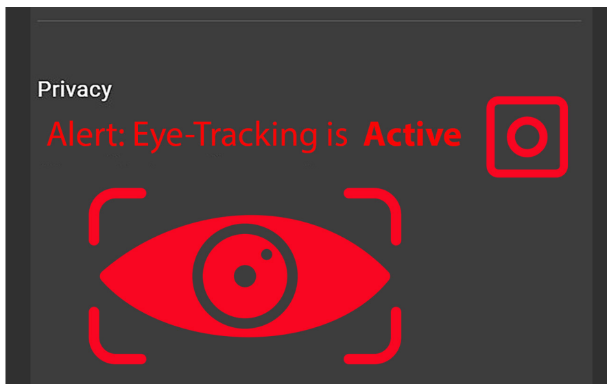
Figure 4 Alert: Eye-Tracking is Active

We can apply the same idea to privacy with eye-tracking by capitalizing on users' familiarity with previous indicators that prime them to privacy-awareness to encourage them to be more conscious and careful with immersive VR technology. Basically, users must grasp that their behaviour is being surveilled and data-mined. One way to do this is to leverage a helpful design feature that became popular during the pandemic. The video conferencing platform Zoom provides an audio alert that announces "recording in progress," adding the visual element of a pulsing red circle next to "Recording..." The notice is attention-grabbing for two reasons. It is multi-sensory (and thus more accessible than one that only stimulates one sense). Additionally, the circle evokes the recording feature on Apple's "voice memos," and the dot is reminiscent of the one signifying that the camera feature is enabled. In VR, similar elements could be adapted to say something like "Surveillance and Data Mining in Process."