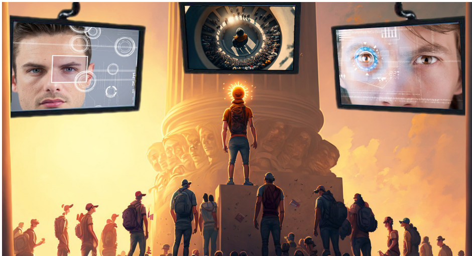
Figure 2 Raised Pillar

Our first suggestion is to have users viscerally confront the meaning of their eyes being tracked in the privacy training module described previously. In a potential immersive VR privacy module, users might find themselves standing on a pillar raised hundreds of feet. Beneath them, a crowd of people are looking at them, and before them are large TV screens, suspended in the air which are all recording and playing the users’ current movements. After a short interval of this disorientating experience, the screen could present to the user relevant data and analytics concerning the scenario in the privacy module.