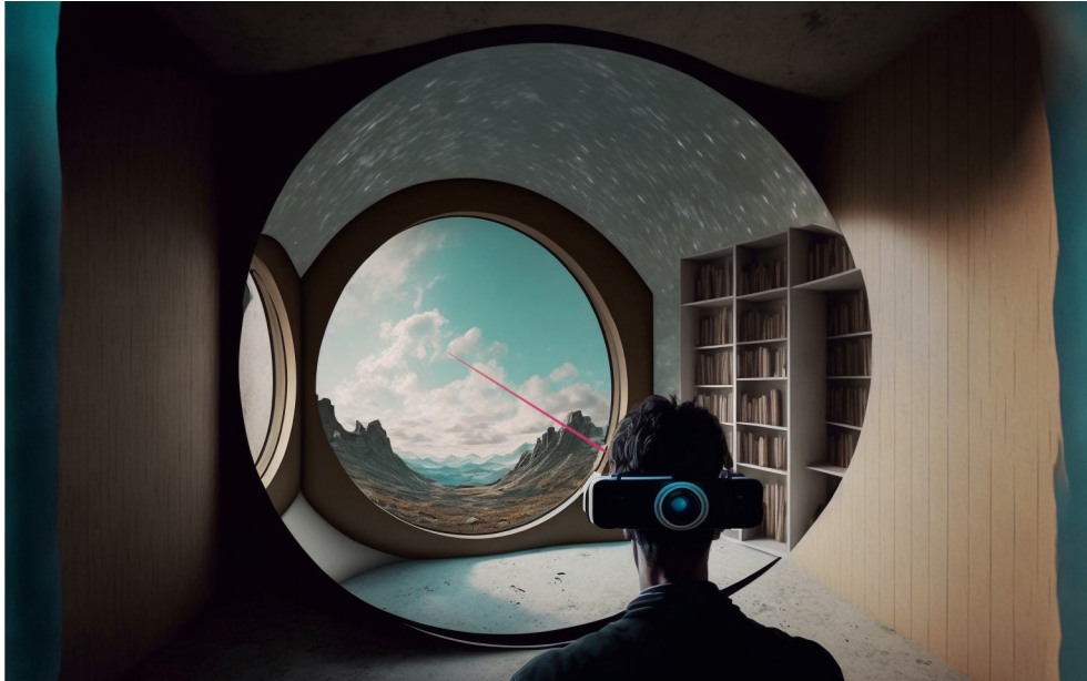
Figure 6 Coloured Tendrils

(henceforth, FBA). 78 FBA is “the selective processing of a relevant feature over unattended feature,” and in this case, the focal features are items like colours and motions. 79 While psychologists find that correctly employed FBA can improve people’s ability to understand and retain information, additional research should be done to determine its efficacy in this context. Furthermore, our eye-tracking design suggestions should be taken as conjectural ideas to consider implementing. As Calo notes, visceral notice suggestions require interdisciplinary empirical experimentation to validate.