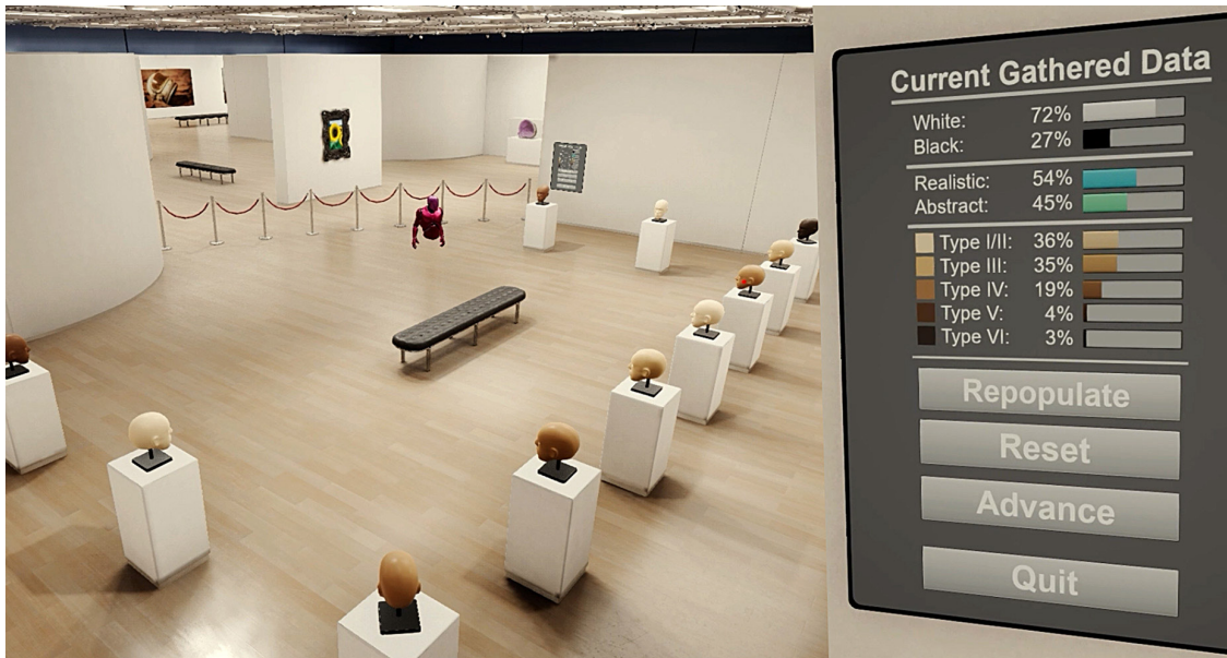
Figure 3 Art Gallery

Designers can further tweak the scenario so that it aligns more directly with Calo’s loan example – an example that renders salient a harm that unfolds over time. Consider one of the most challenging privacy issues: helping individuals understand that individual actions can have profound long-term societal impacts. To illustrate this point through showing, users could re-enter the art exhibition after being presented with the initial core eye-tracking information. Now, the virtual space will have changed. If users previously looked more at figurative than abstract art, this time, only figurative art will be displayed. Or, if users looked more at light-skinned than dark-skinned sculptures, only light-skinned ones are displayed. Having had a chance to explore the updated environment, users are presented with an explanation for the change: the gallery has been altered to showcase seemingly preferential content. The experience could prompt the user to think critically about whether it is a good idea to engage in activities that exacerbate the influence of bias and lead to virtual worlds having less diversity.