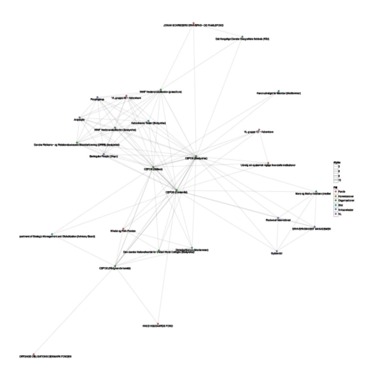
Figure 7: CEPOS' network relations