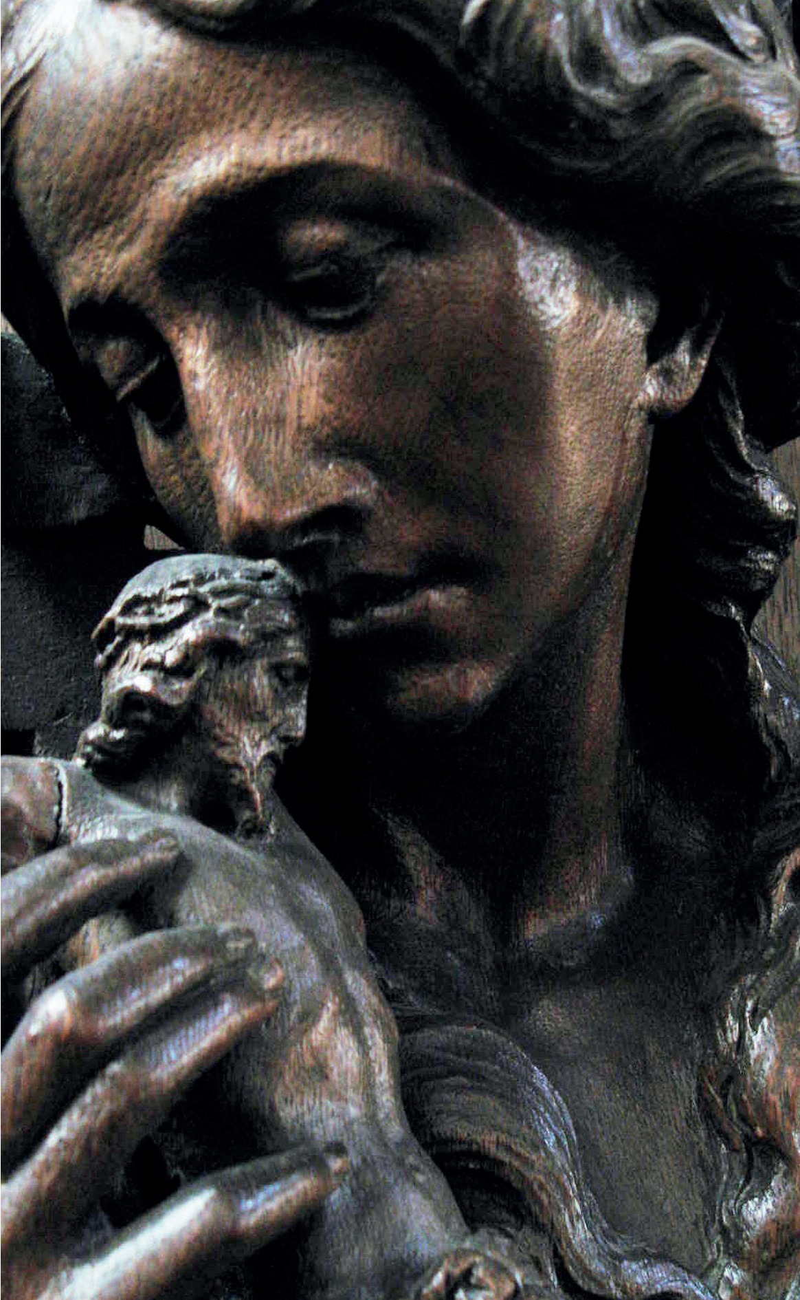
[2] Passion piety. Pious contrition adoring Christ crucified. Sculpture on a confessional in St. Catherine's church in Mecheln, Brabant. Carved around 1680 by Nicolaas van der Veken (1637-1709).