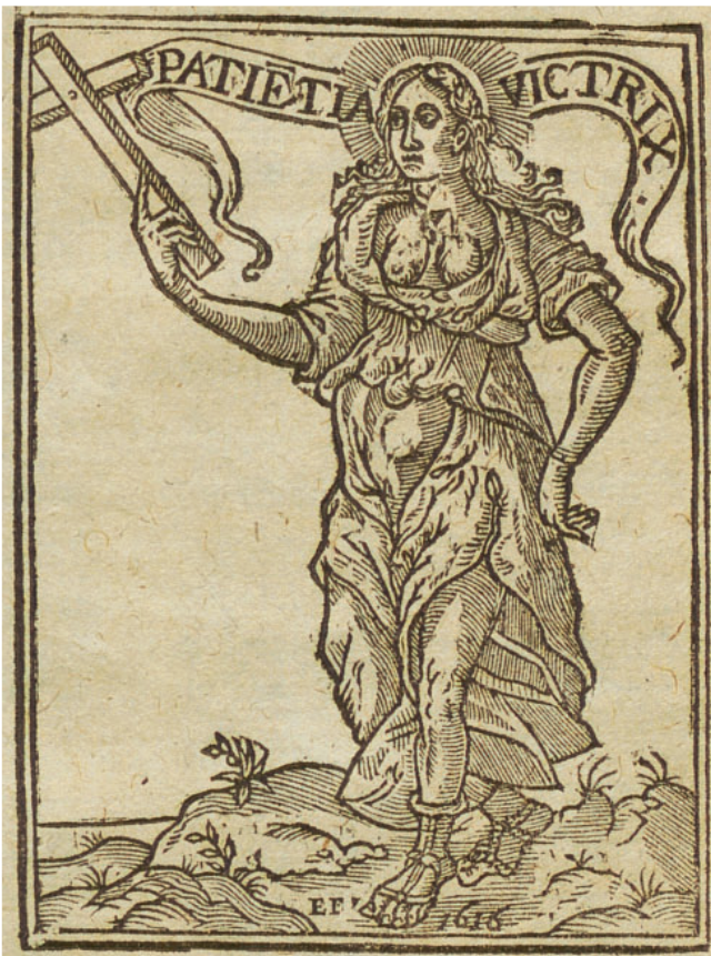
[9] Patientia Victrix, woodcut, the last illustration in Surculi sacri pullulantes e palma, 1620, signed with initials EF and dated 1616.