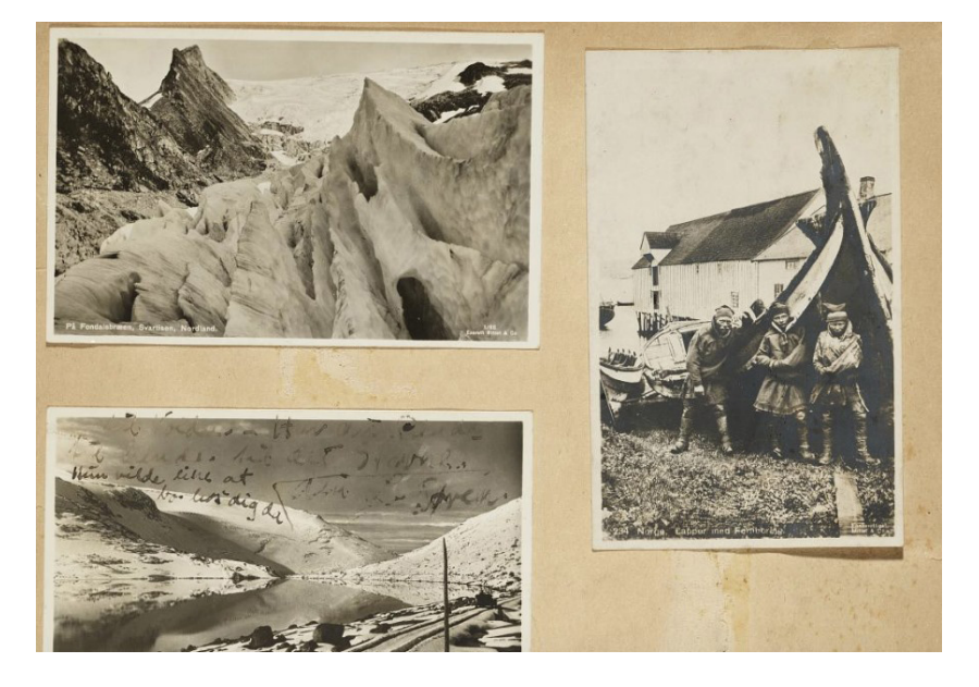
[4] Postcards assembled from Sápmi, ca. 1937, William H. Johnson Papers, Archives of American Art, Washington, D.C.