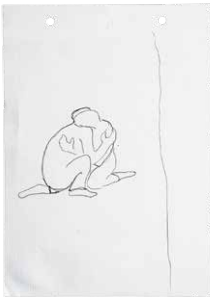
First case: Extracts from one in-situ notebook, student, Sisters Academy—The Boarding School , Den Frie Centre of Contemporary Art, Copenhagen, Denmark, 2017.