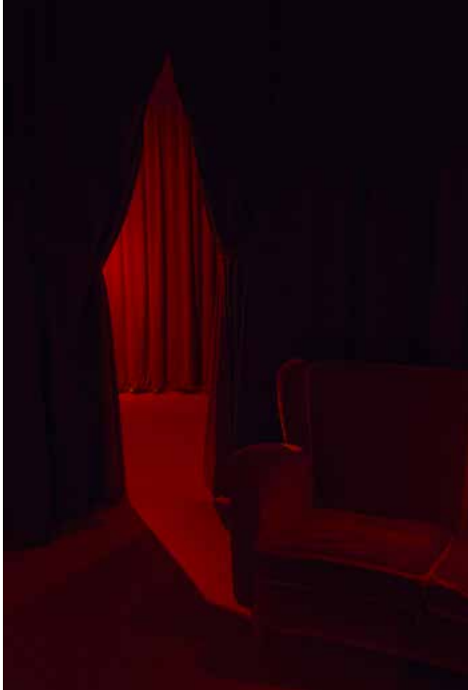
The entrance from The Hallway to The Dining Hall in Sisters Academy, Sisters Academy – The Boarding School, Den Frie Centre of Contemporary Art, Copenhagen, Denmark, 2017.