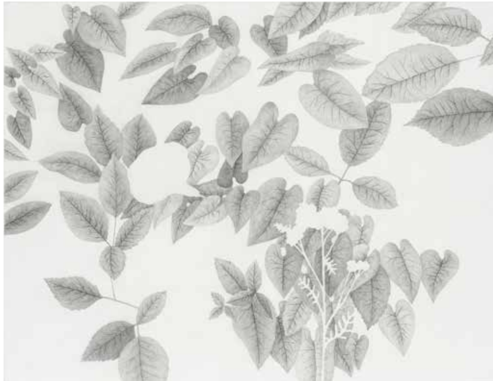
Maria Finn: Grey # 14 , 2019, pencil on paper, 50 x 65 cm.

in-between are important for a city, since they leave room for individuals to experience unmapped territories that invite other readings of urban space.