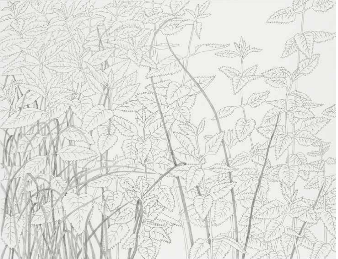
Maria Finn: Grey # 16 , 2019, pencil on paper, 50 x 65 cm.

woven stories about what surrounds us. Morris's patterns combine sober observations of garden life with rhythmic ornamentation to create a unique space. At times they can be almost hypnotic in their intricate organization, and I enjoy studying them as sketches, made with pencil and a few colored fields. It is as skeletons for his patterns that I can truly appreciate them. These sketches have also inspired me to make my own drawings of vegetation, where instead of depicting garden plants I study the plants that grow on abandoned lots, especially weeds. The simple line of the drawing reveals the care Morris took at observing nature, a detail lost when all the layers of color are added. My own observations become