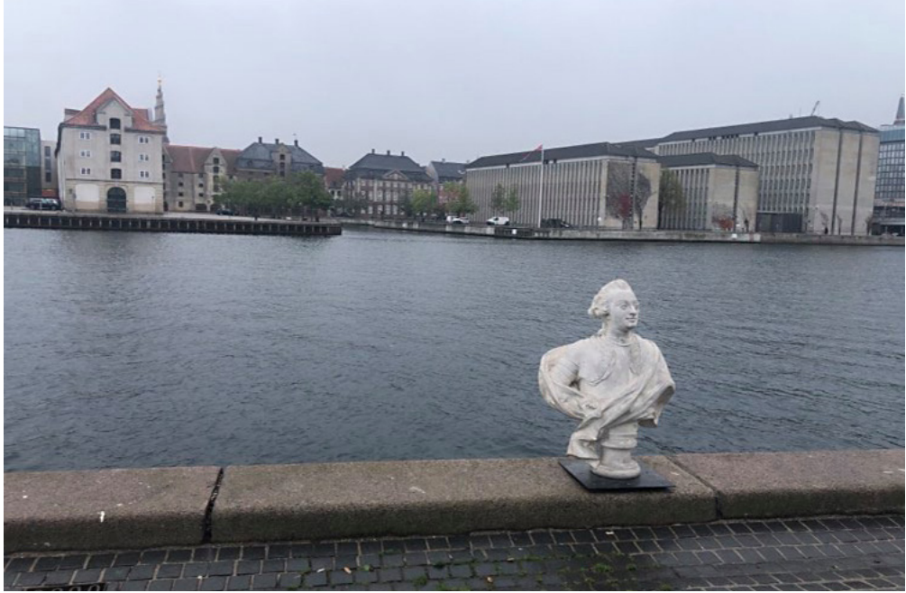
Plaster cast copy of the bust of Frederik V on the harbour of Copenhagen, Anonymous Artists, 2020.