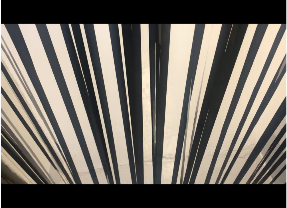
Wit(h)nessesing , Peter Brandt, 2020-21 (detail). Material from 1 VHS tape of Pier Paolo Pasolini's film Salò, or The 120 Days of Sodom , 1975, adhesive tape, 218x126 cm. 2020-21.

What does it mean to be touched by Salò, or the 120 Days of Sodom today?