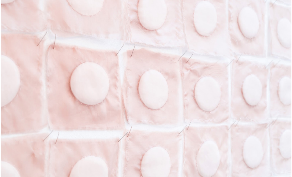
The Order of EMPATHY (detail), Peter Brandt, 2016-17. Silk, cotton pads, safety pins, stone from the crime scene, azorbé wood, 210x130x4 cm. 25x19x11 cm.