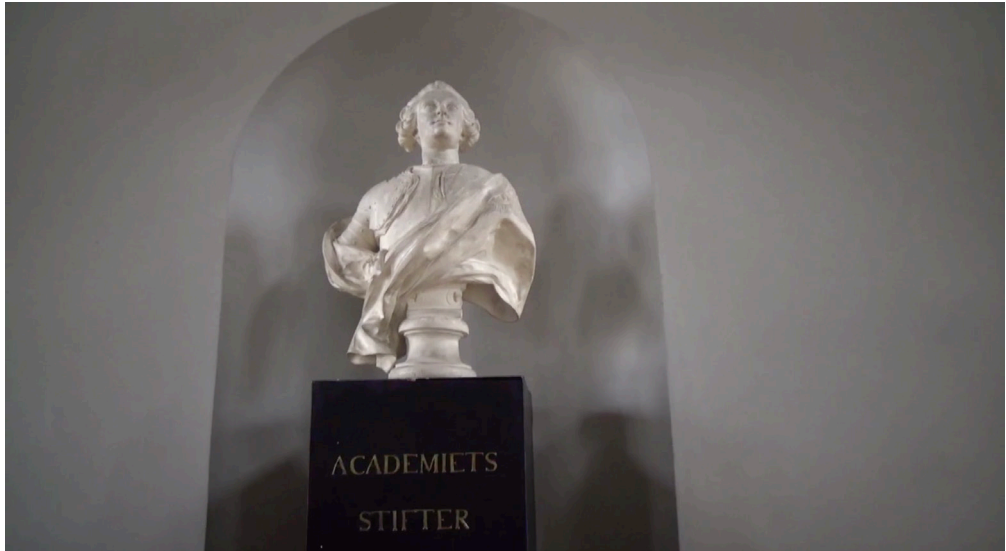
Still from video, Anonymous Artists, 2020.

you have been subjected to death threats and insults by your neighbour since 2020, and a near-death violent attack in Rome 2002.