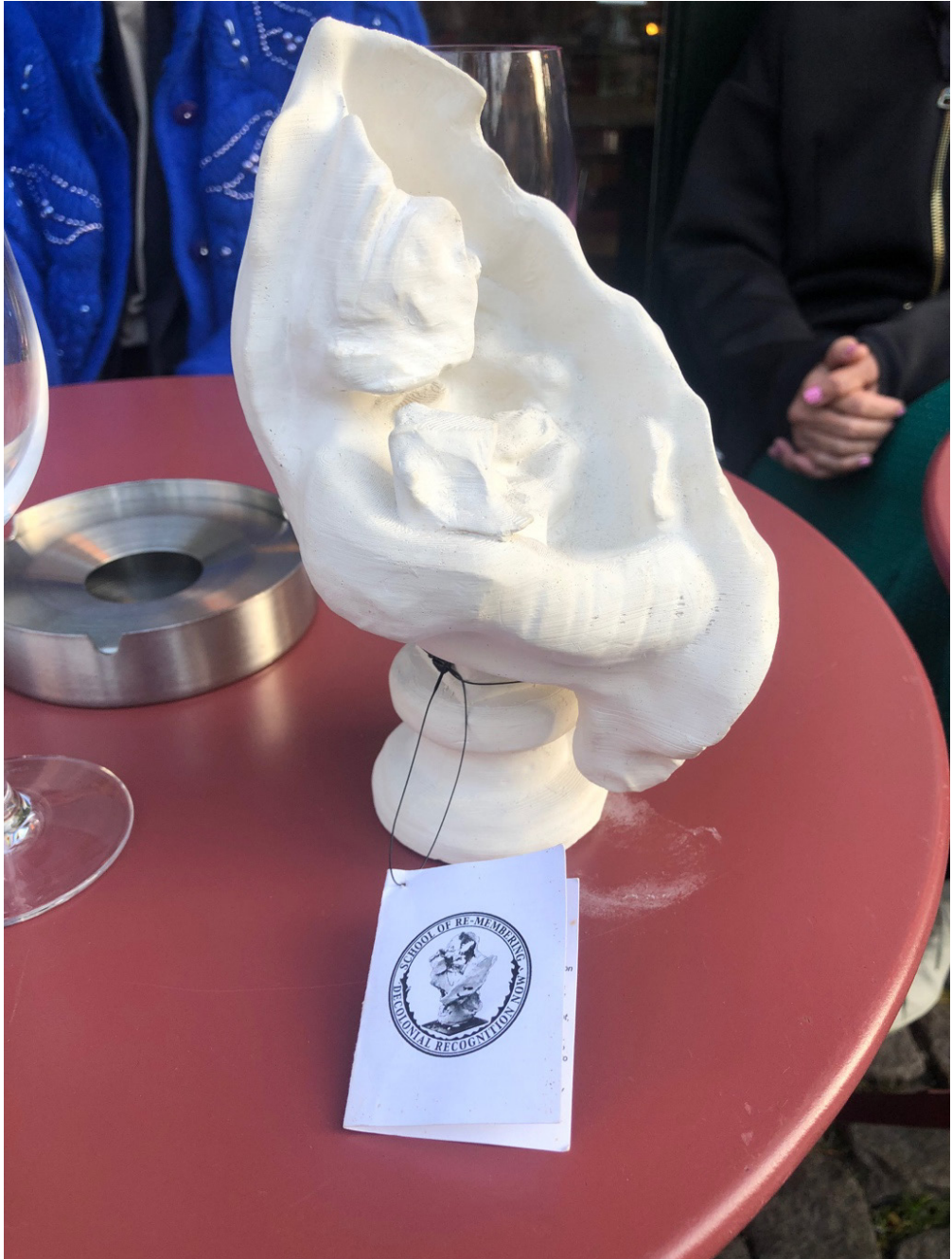
School of Re-membering, 2021. Student-led initiative producing souvenir plaster busts of the rematerialised plaster cast copy of the bust after its transformation in the water.