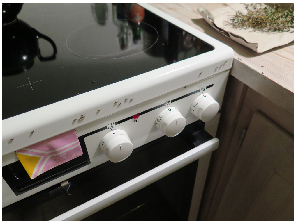
Ants walking on cooking range: Relating at home to our ant performers (or, their cousins, Lasius Niger).

The following sequence may illustrate one of the ways we created material through our interdisciplinary collaboration: a kind of real-time collage.