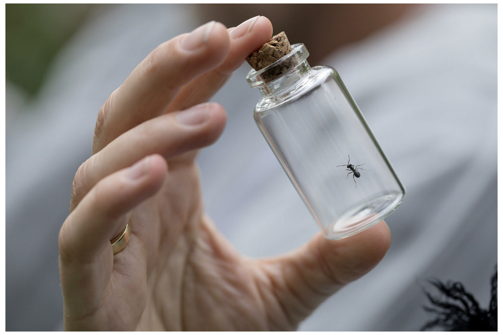
An ant for each guest – in Danish called 'orange ants' because they taste like oranges.