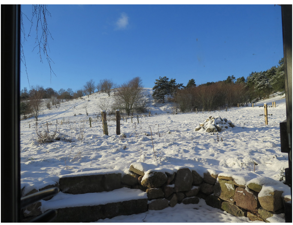
The snow-covered landscape.

The snow-covered hills also functioned as a type of sensory lens for the whole session. The magic of how the landscape was radically changed, and how we all inevitably revisited sensory experiences from snow-winters of childhood, seemed to place us all in a sphere of in-between. This became a place where perhaps more things were possible than when walking on the hard and very concrete surface of soil or asphalt; a fairytale-like space, where each step happened in the sound-muffling crunching of the soft snow. The snow functioned as a concrete alteration of our bodies so that we became susceptible to perhaps being something else than only humans. No one was — even indirectly — invited to imagine being ants. But we were humans alert in a poetic space created by the encounter of what we each offered, all placed in an immersive sphere and perspective-changing prism of snow.