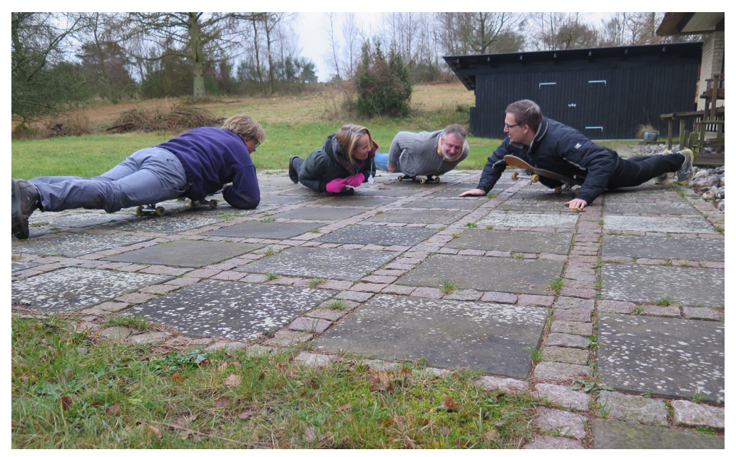
Having fun, trying out an idea, which became what in Danish theatre-lingo is called "A Killed Darling".