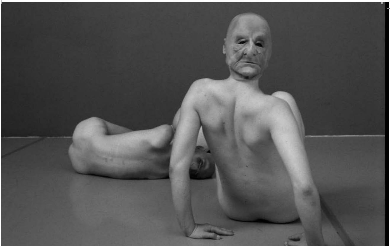
Mette Ingvartsen: Manual Focus , 2003.