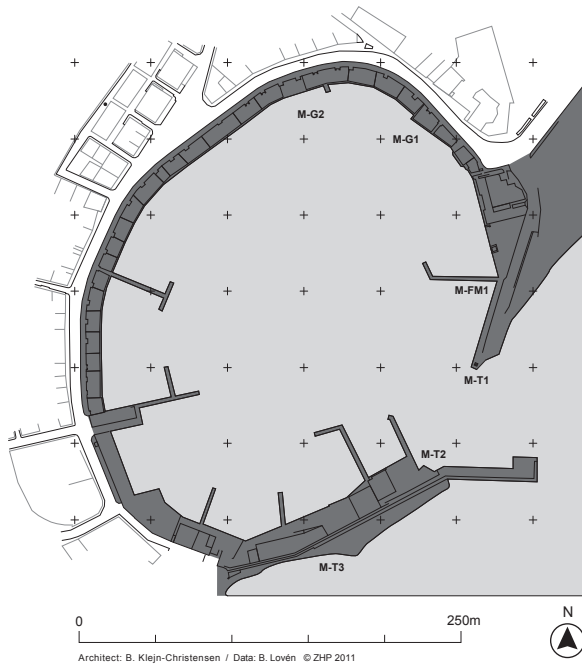
Fig. 2. Mikrolimano Harbour (ancient Mounichia): areas under investigation in 2009 and 2010.