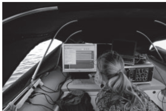
Fig. 10. Geophysical survey of the harbour fortifications in Zea Harbour.

Selected areas in and around the Zea and Mounichia Harbours were surveyed using a 'Chirp II' sub-bottom profiler (Fig. 10). The objectives of this geophysical survey were to locate any ancient harbour structures and to document the bathymetry below the sediments. At both Zea and Mounichia, previously unknown remains of the fortified moles flanking the harbour mouths were