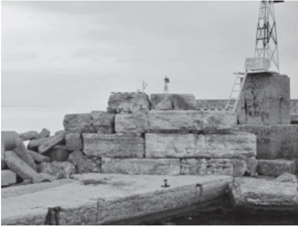
Fig. 6. Mounichia Harbour: Tower M-T1 from the north.