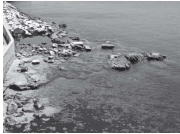
Fig. 7. Mounichia Harbour: area of Tower M-T3 from the south.