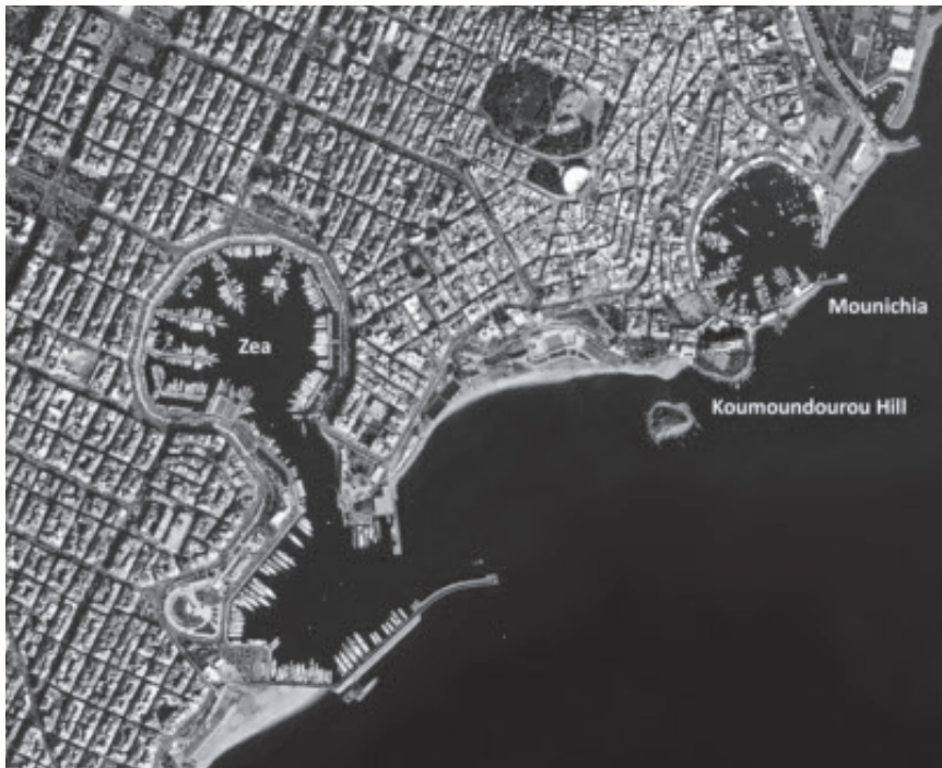
Fig. 1. Satellite photograph of the coastal area between Zea and Mounichia Harbours (© Google Earth Pro 2009).

perstructure foundations of these shipsheds extend for a distance of at least 33.6 m from the modern shoreline and to a depth of more than 2 m. This area will be crucial for understanding sea level change since Antiquity, and hence the harbour front topography of the ancient Piraeus. Large areas of the modern harbour in this area were also surveyed digitally in detail, providing data useful for understanding how its development has affected the ancient harbour.