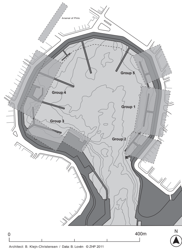
Fig. 8. Zea Harbour: topographical reconstruction of Groups 1-5.

In the southernmost part of Area 2, more than 90 m 2 were surface cleaned in 2010 in order to answer a very important question: how far to the south do the Group 1 shipsheds extend? Two well-preserved, rock-cut colonnade foundations define the southern side of Shipshed 34, and the Group 1 shipsheds have been followed for a total length of 143 m along the modern shoreline (Fig. 8). The investigations also exposed large areas of ancient quarrying that has destroyed parts of Shipshed 34.