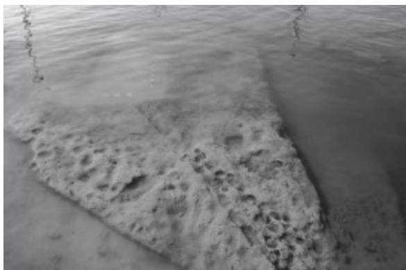
Fig. 9. From left to right:., southwestern open-passage and rock-cut ramp foundations of Slipway 36 (B. Lovén © ZHP 2009).