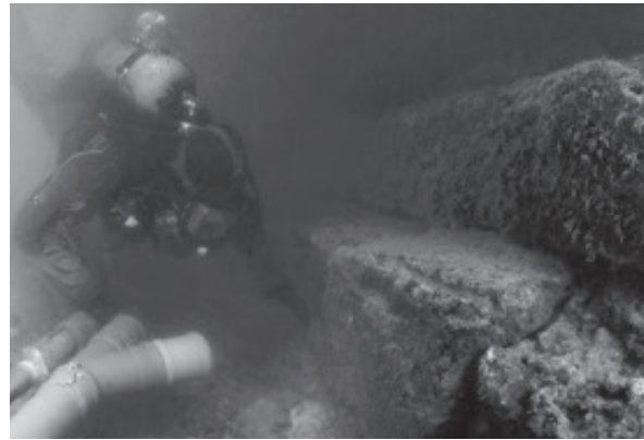
Fig. 5. Excavations on west side of the fortified mole M-FM1.

Mounichia Tower 2 (M-T 2 ; Fig. 2) is tentatively defined as the entrance tower of the southern fortified mole (M-FM 2 ). Visual inspection identified several large blocks and segments of worked bedrock northeast of the southeasternmost jetty in the harbour. Features were difficult to assess due to encrustations and beach-rock. Individual blocks exhibit pry-marks, while one had a rock-cutting for a T-clamp. A similar T-clamp cutting has been identified in the foundations of M-T 1 . All features are severely eroded.