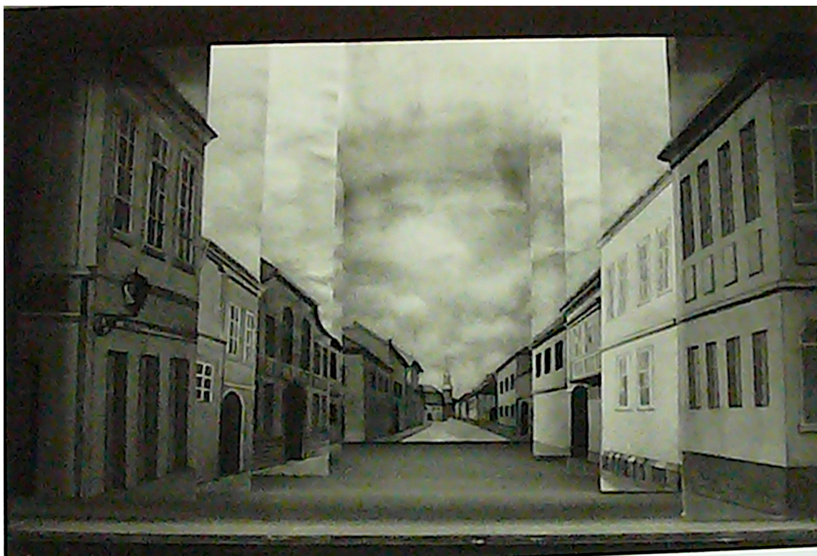
Fig. 2. A scale model made by an unidentified student in Paul Suominen's class of technical drawing 1987. There is a fake perspective making the street look longer and going uphill. Photographer unknown.

The obvious linkage between Hedström and the Bauhaus-tradition was the purification and compression of the spatio-visual expression into its elementary components and thinking through material. I have not found evidence that Hedström