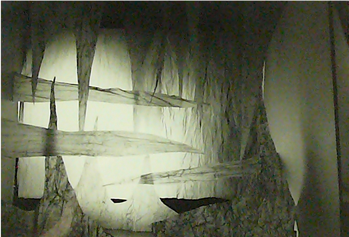
Fig. 5. Spatial composition on the theme: Dream vision of a Finnish landscape made by the second year student Tarja Väättäin in Eeva Ijäs's class 1987.

ply 'Scenography I', which became the cornerstone for the education. It was informal teaching that consisted of designs for imaginary productions – so-called paper-projects – and small-scale free-form assignments. 77 For instance, the students were told to construct a space that was a dream vision of the Finnish landscape into a small box using only one material. Otherwise they had free hands. 78 Ijäs recalled that she tried to avoid illustration and simple realism. The leading idea was to conceptualize one's thoughts so that they could be displayed in visual and spatial form: "For example, I tried to explain to students how power is manifest in Richard III , and how that could be made perceivable in the scenery." 79