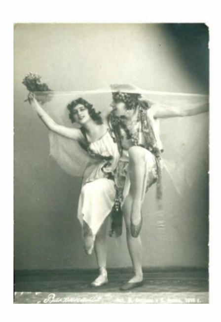
Фотография. Робен и Струков в ролях. "Вакханалия"