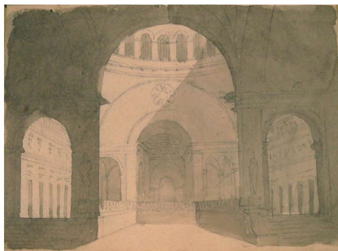
FIGURE 3. Antonio Basoli's Sala di un Tribunale , Etching XIV Collezione di Varie Scene Teatrali , 1821.