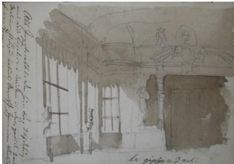
FIGURE 2. C. F. Christensen's sketch for the ballet La Gypsy Act Three at the Paris Opera. The Theatre Museum.

The Act Three set for La Gypsy is also noteworthy. The libretto reads, "A dining room in Lord Campbell's residence. A window in the background looks out to a park. To the right a door to the library." 22 Christensen's first note is significant: "Everything practical." (See Figure 2.) Using practical stage elements for everything was an enormous departure for Christensen compared to the norm at The Royal Theatre. A practical stage element is any object which appears to do onstage the same job it would do in life. So in the case of La Gypsy , the window in the background would be a real window, as would the door. Before Christensen traveled to Paris, the use of practical stage elements at the Royal Danish Theatre was limited. Practical elements were used occasionally, but to compose the entire stage picture using practical elements was something new to him.