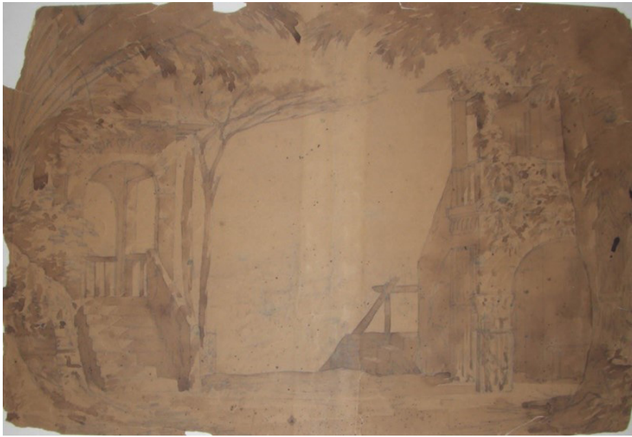
FIGURE 5. Christensen's scenographic sketch for the ballet The Festival in Albano , 1839. The Theatre Museum.