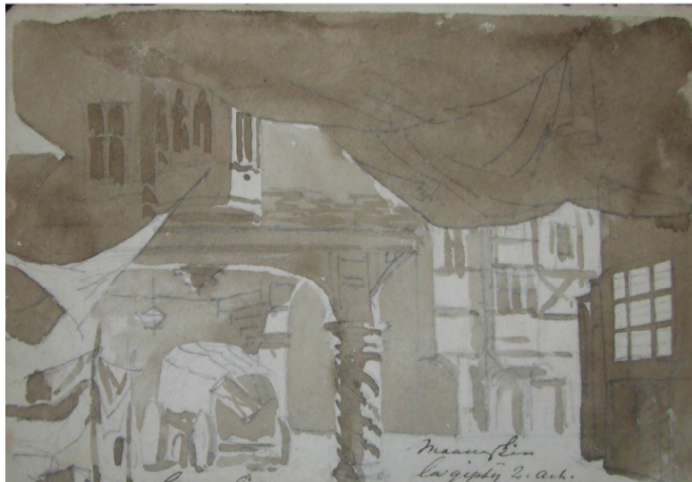
FIGURE 1. C. F. Christensen's sketch for the ballet La Gypsy Act Two, scene 1 at the Paris Opera. The Theatre Museum.

His sketches for La Gypsy are far more complete than the ones for Le Lac des Fées and show shadows and highlights, but also include specific notes about each scene. (See Figure 1.)