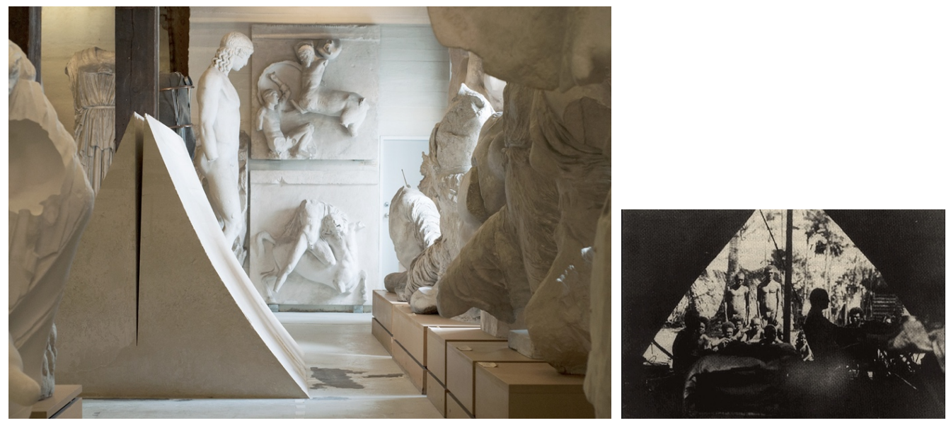
(Telt, 2015. A.Holm)