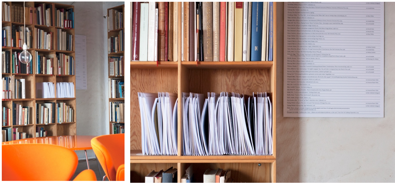
(Installation view: Hvid[ma] Archive, 2015. Lounge of the Royal Cast Collection, Westindian Warehouse.)