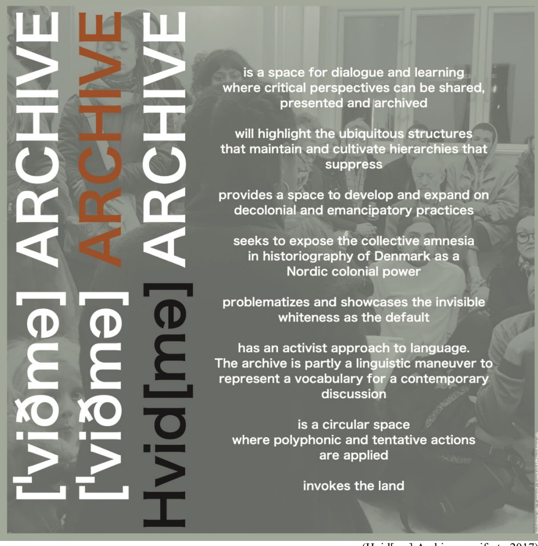
(Hvid[mə] Archive manifesto 2017)

By questioning collective European memory, its borders and language, as it is more multi-layered than multicultural, we(eye/eye) wish to re-introduce and revisit what a critical artistic research project may contain, by focusing on decolonial practices and aesthetics, with relevant updated narratives as the artistic signifiers. Focusing on different working methods within critical theory and decolonial practices, we(eye/eye) work to create a more conscious space where one may share different perspectives and experiences, sharing knowledge within a flat structure. But at the same time taking the responsibility to create a safer space (if such exists) within the art world, to host dialogues and show artistic work.