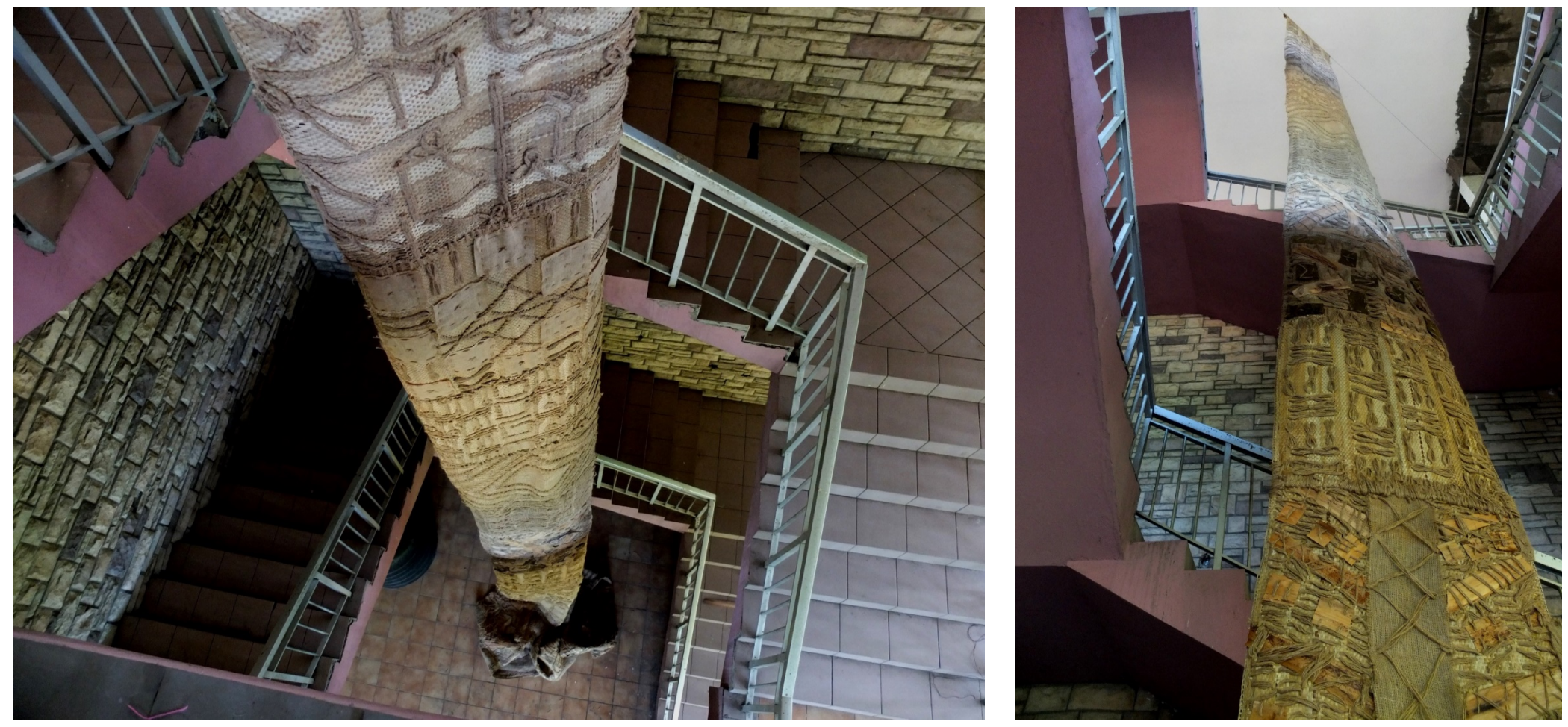
Dorothy Amenuke, Scroll . Installation view from The Gown Must Go to Town . Museum of Science and Technology, Accra, Ghana, June 19 – July 31, 2015.