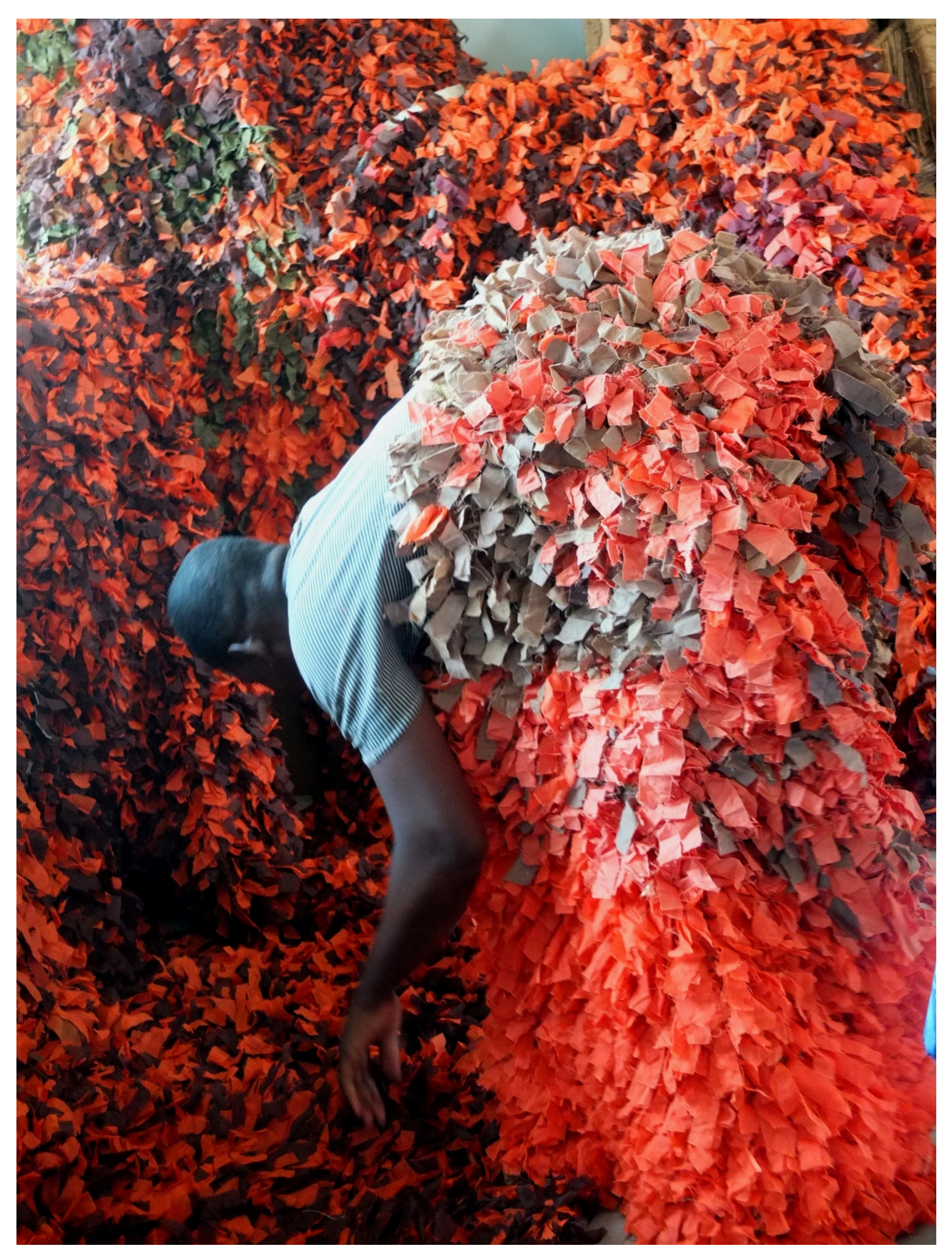
Dorothy Amenuke, In the Nest variation, 2013