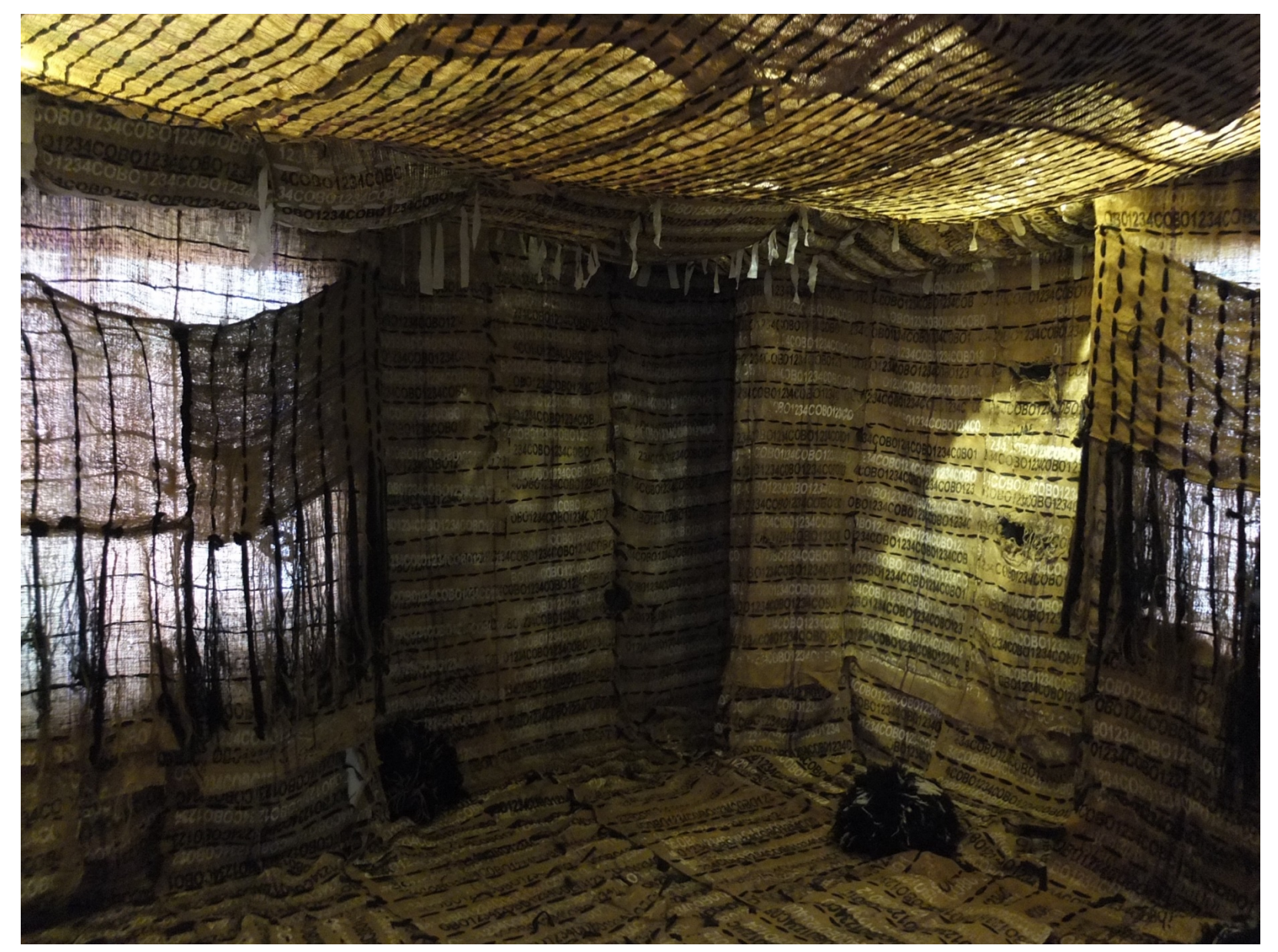
Dorothy Amenuke, Coded. Installation view from Twists, Turns and Broken Doors , Nubuke Foundation, Accra, Ghana, June 17 – September 30, 2017.