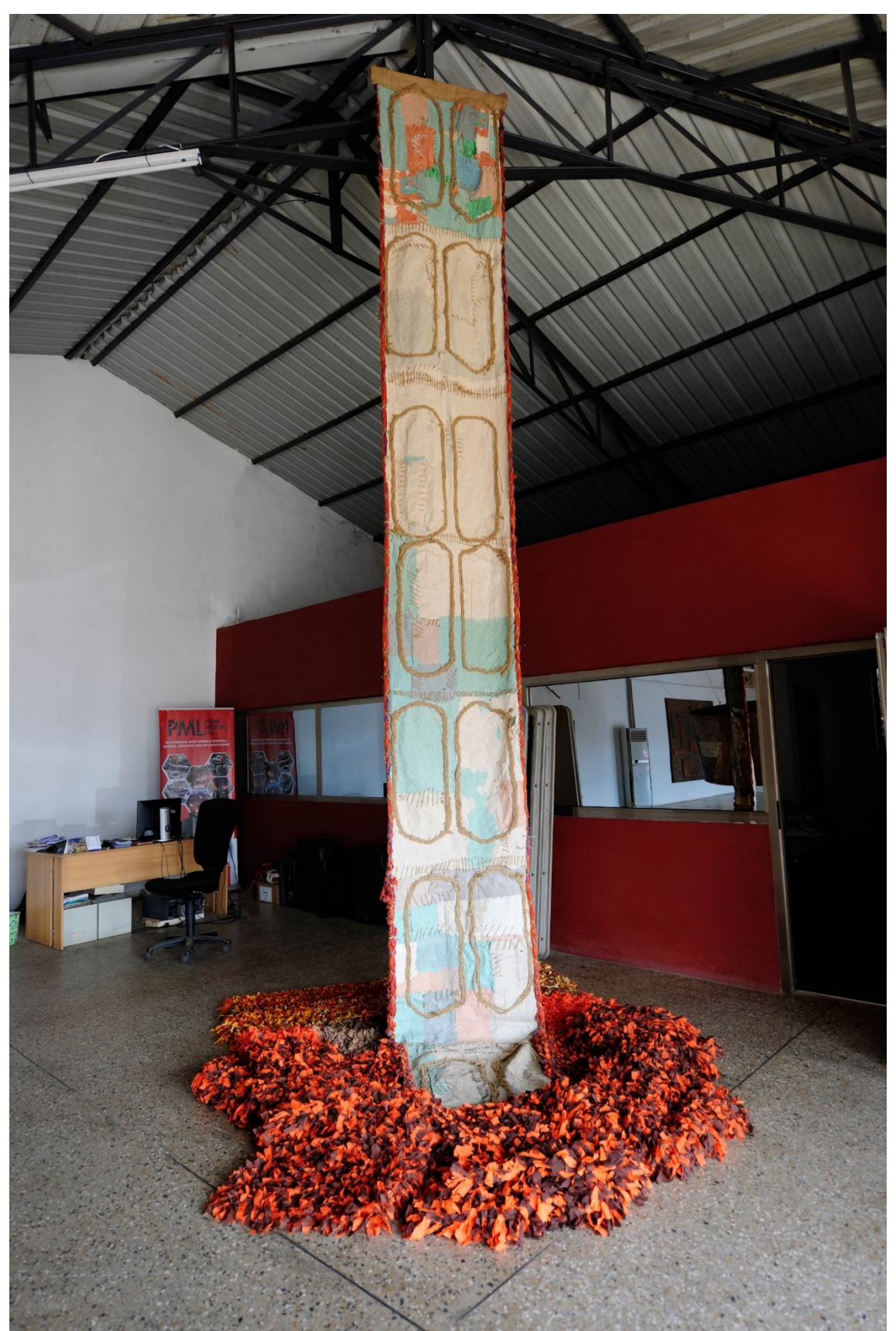
Dorothy Amenuke, The Scroll . Installation view from Silence Between the Lines , New Ghanaian Contemporary Art, Kumasi, Ghana, February 19 - 23, 2015.