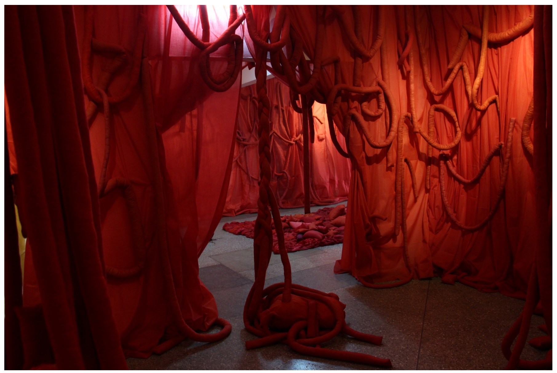
Dorothy Amenuke, Habitation-Inhabitation . Installation view from Twists, Turns and Broken Doors , Nubuke Foundation, Accra, Ghana, June 17 – September 30, 2017.