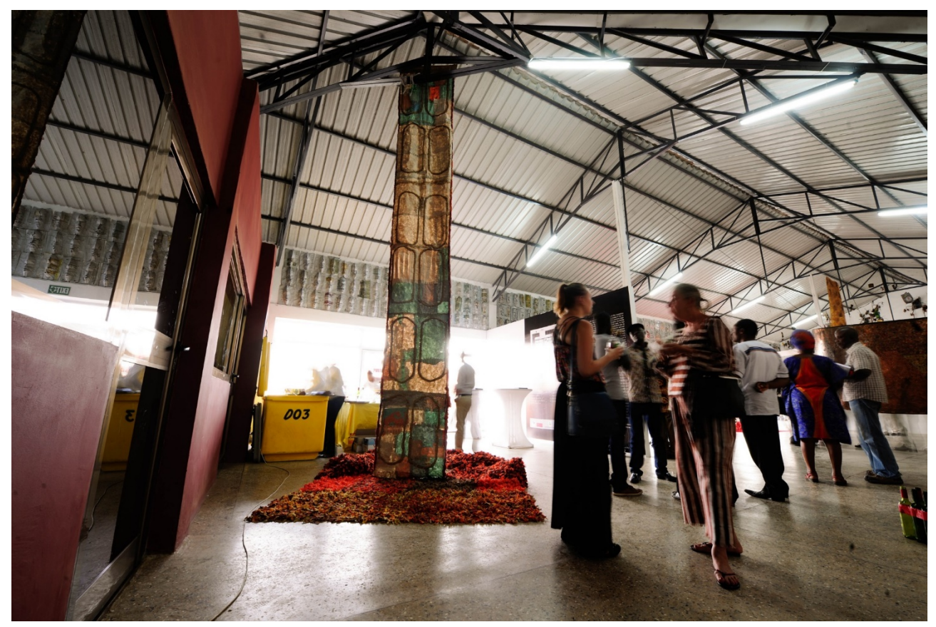
Dorothy Amenuke, The Scroll . Installation view from Silence Between the Lines , New Ghanaian Contemporary Art, Kumasi, Ghana, February 19 - 23, 2015.