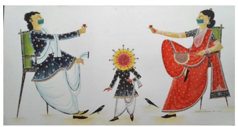
Figure 5: The bābu, the bibi and the coronavirus.