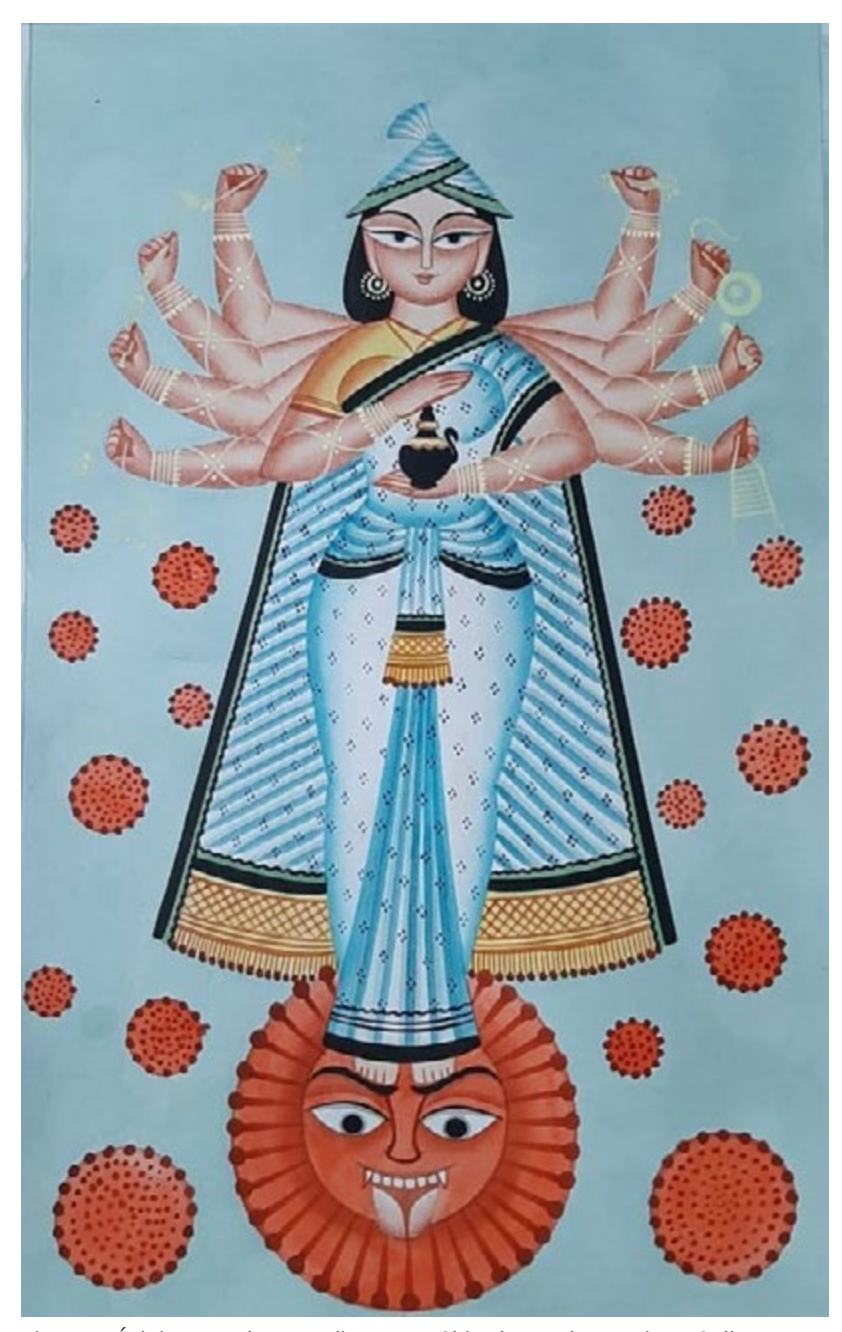
Figure 4: Śakti Rūpe. Photo credit: Anwar Chitrakar and Emami Art Gallery.