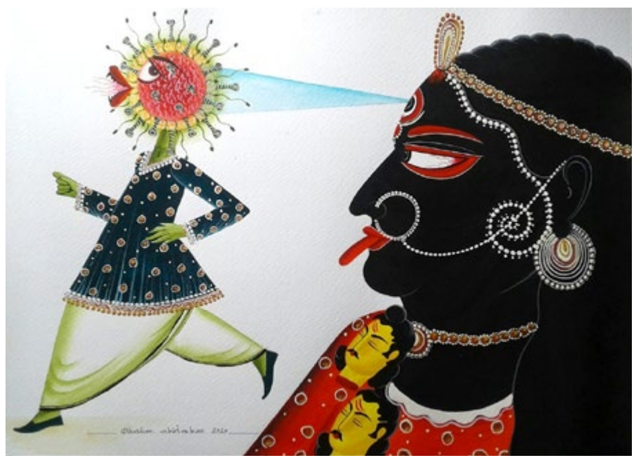
Figure 6: Goddess Kālī vanquishing the coronavirus. Photo credit: Bhaskar Chitrakar.