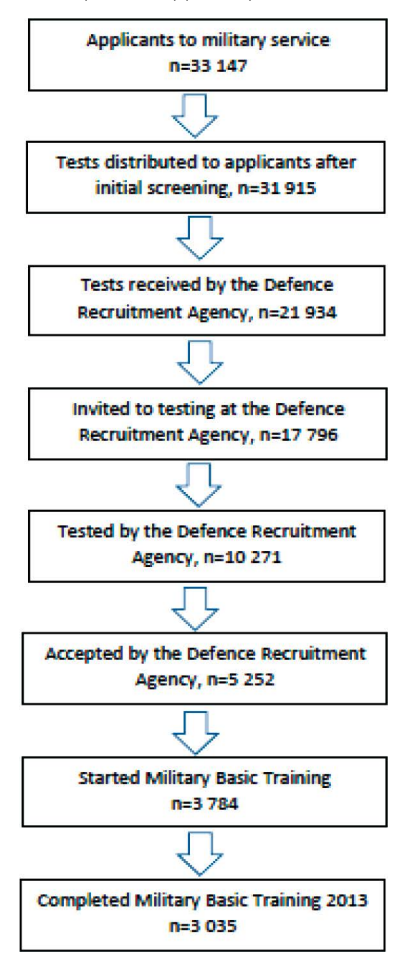
Figure 2 The stepwise recruitment process applied by the Swedish Army (SOU 2016).

youngsters. It's really something where you need to be talented, more than in many other occupations' (Gillberg et al. 2018).