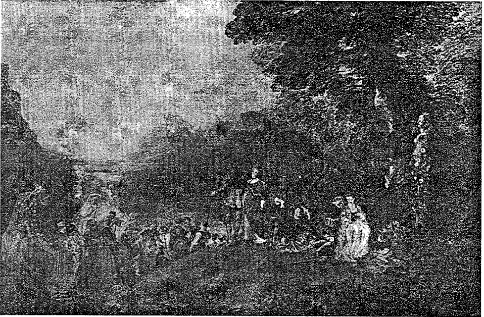
Antoine Watteau, Pilgrimage to the Island of Cythera , 1717

obedient to the imperatives of style. In the 18th century it is a set of abstract rules that constitutes style – and, in turn, man. 3