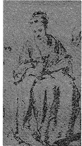
D r a w i n g s b y W a t t e a u

Our perspective: that is basically the perspective that emerged in the 19th century. In the 19th century the relationship of man and style switches into the distributions of functions that we readily take for granted today. Now, man is no longer constituted by the forming power of style; style is rather constituted by man – or so, at least, is the newly adopted belief. Le style est l'homme même. now this means that a man does