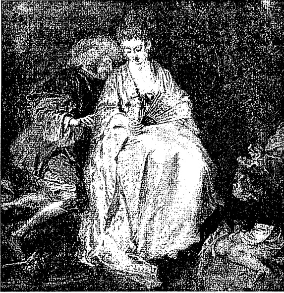
Watteau, Pilgrimage... – Detail

ways reflect (and reveal) the rhetorical requirements of their highly styled social interaction. Secondly, concerning the way in which