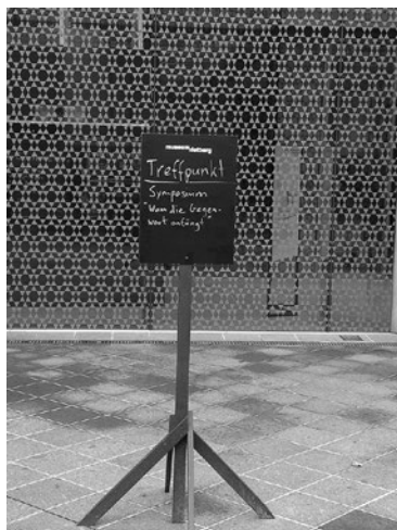
Fig. 2. Photo of Museum Rietberg Symposium Sign.