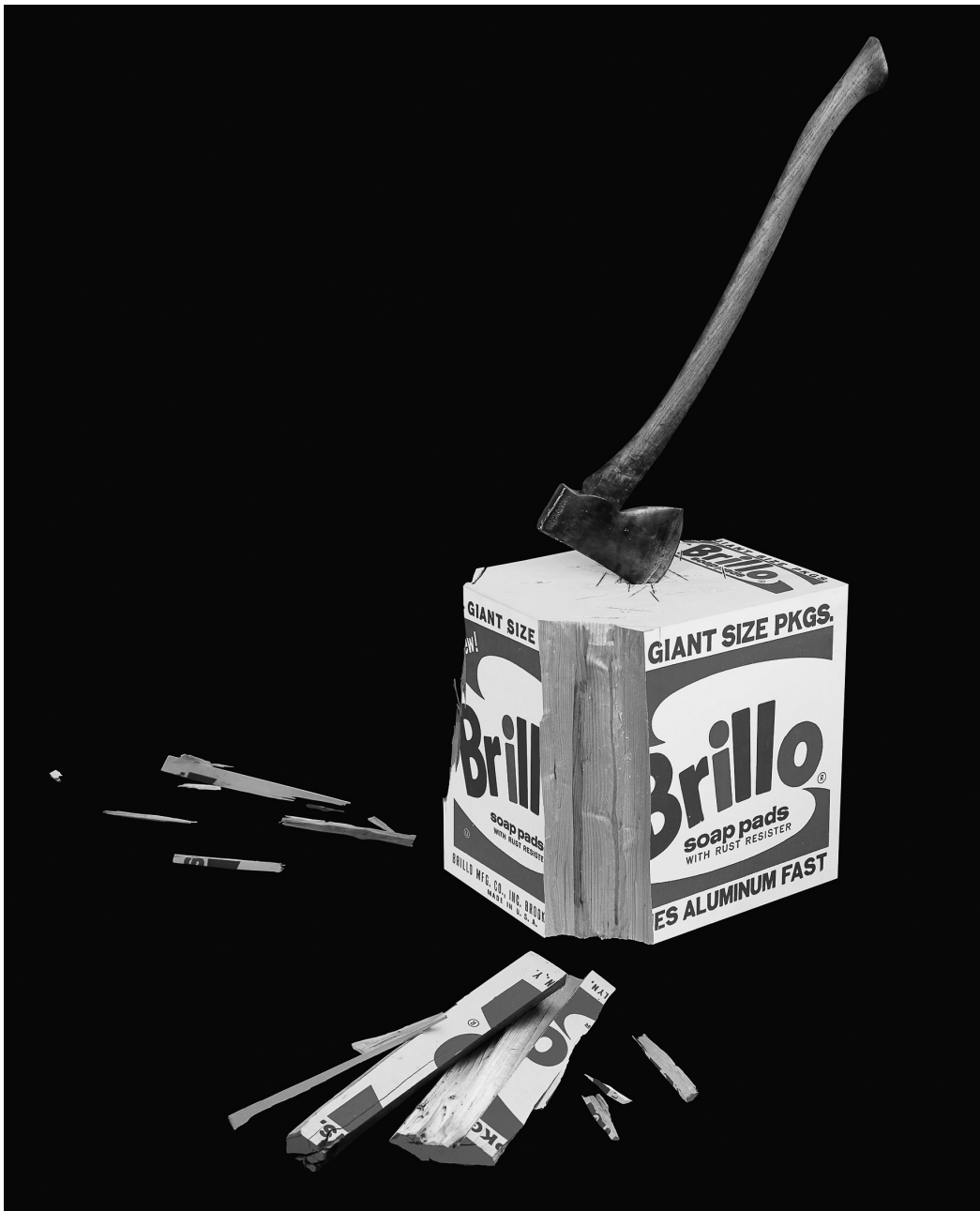
Charles Lutz, Memento Mori, 2011. © 2011 Charles Lutz.