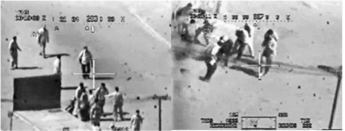
Gunsight footage of the July 12, 2007 Baghdad airstrike leaked to the public in 2010 as Collateral Murder by Chelsea Manning and the online whistleblower site Wikileaks.