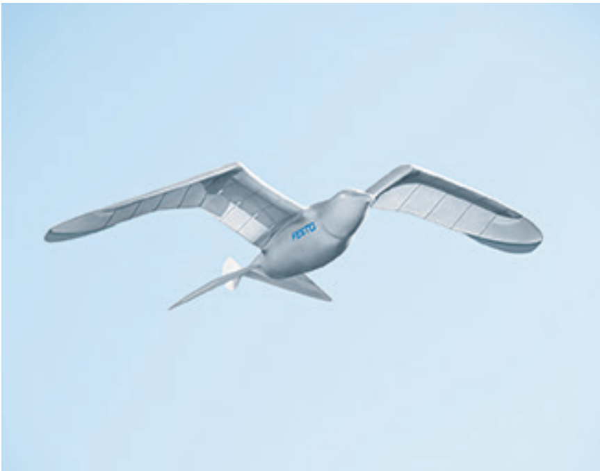
The bionic "SmartBird" developed by the German industrial control and automation company Festo.