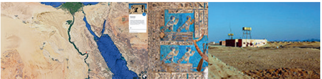
Map of location of Dandarah Temple complex in Egypt, a wall detail and a photograph of the American military airbase in Wadi Gena used by the US Armed Forces as part of Operation Eagle Claw in 1980.