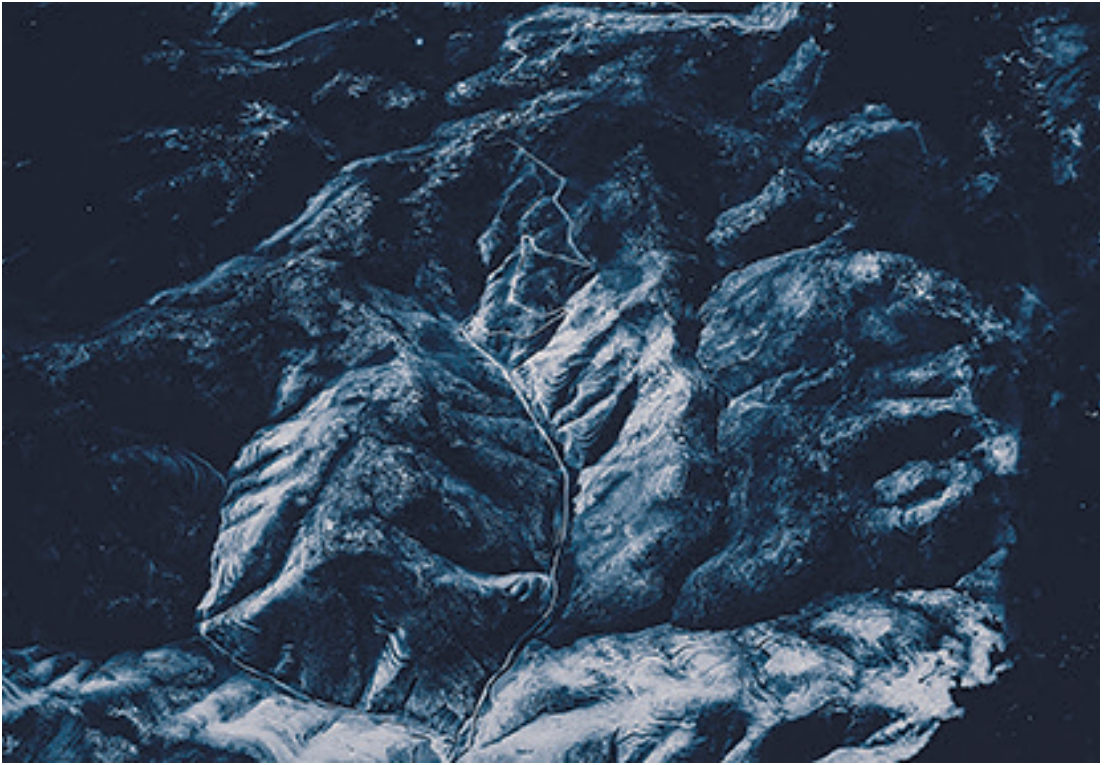
Heba Y. Amin, Artistic rendering of first aerial photographs of Palestine (ca. 1900-20), Jericho Road from 3000 meters, 2020. (ref. Matson G. Eric and Edith Photograph Collection).

The G. Eric and Edith Matson Photograph collection originates from the American Colony (1881–1934), a Christian utopian society founded by Chicago residents Anna and Horatio Spafford in Jerusalem 1881. The society was later joined by members of the Swedish Evangelical Church. Housed in the U.S. Library of Congress, the Collection is made up of over 22,000 glass and film photographic negatives and transparencies. See https://www.loc.gov/pictures/collection/matpc