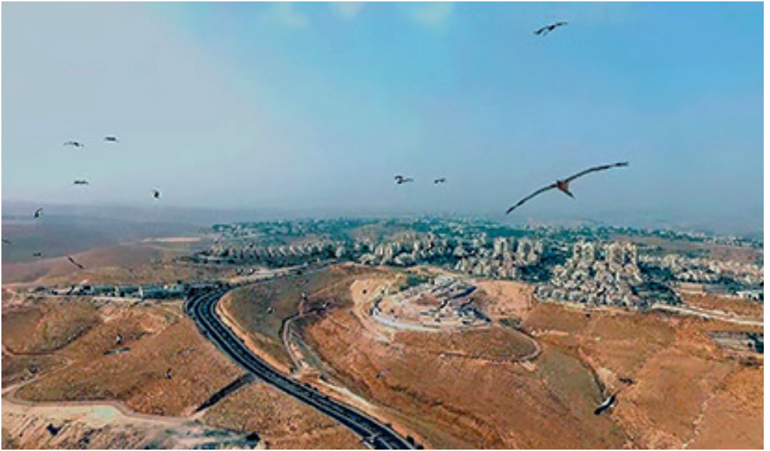
Heba Y. Amin, As Birds Flying , 2016. 7'11" Video Still.

As Birds Flying (2016) is a short allegorical film that uses found drone footage (including aerial views of savannas and wetlands, and Israeli settlements in Galilee) and audio sequences from the 1995 film Birds of Darkness , starring Adel Imam and directed by Sharif Arafah.