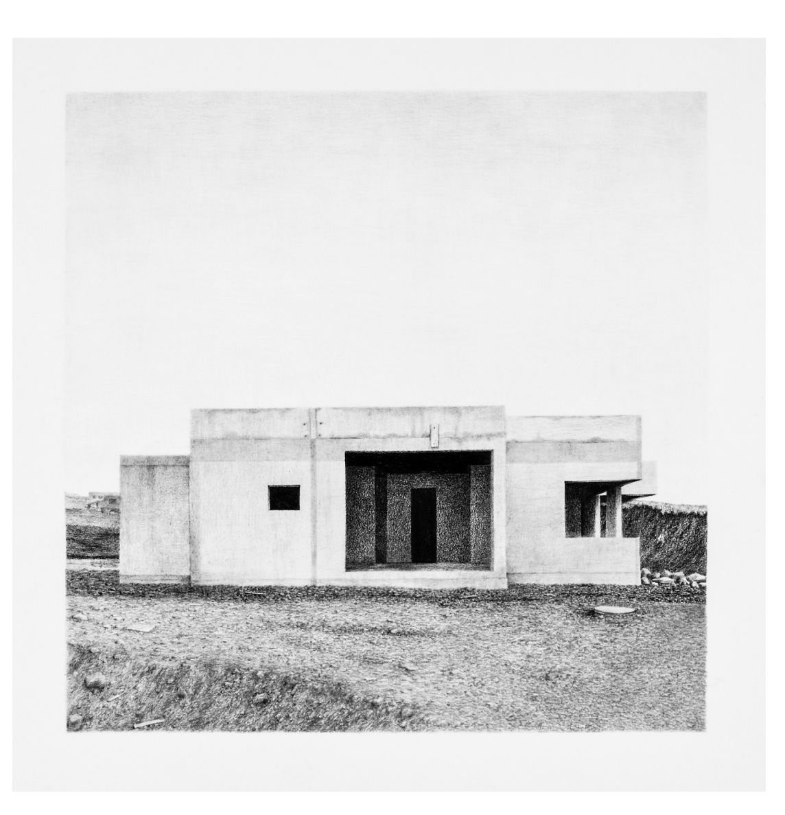
Fig. 2 Guðjón Ketilsson, untitled, 2009, pencil on paper, 40×40 cm.