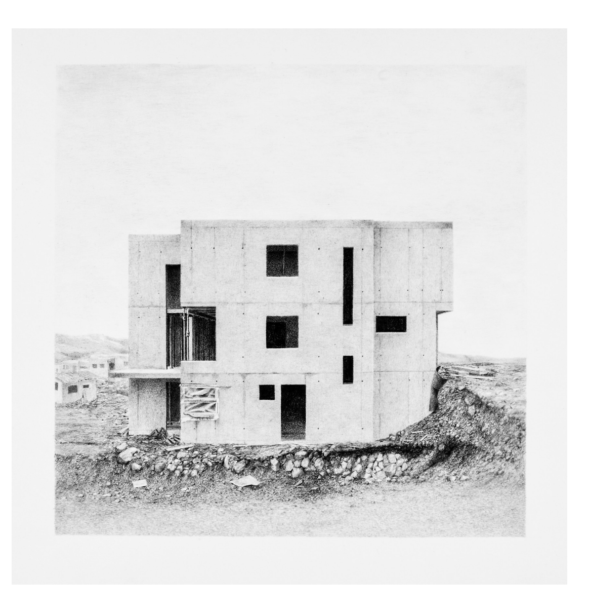
Fig. 1 Guðjón Ketilsson, untitled, 2009, pencil on paper, 40×40 cm.