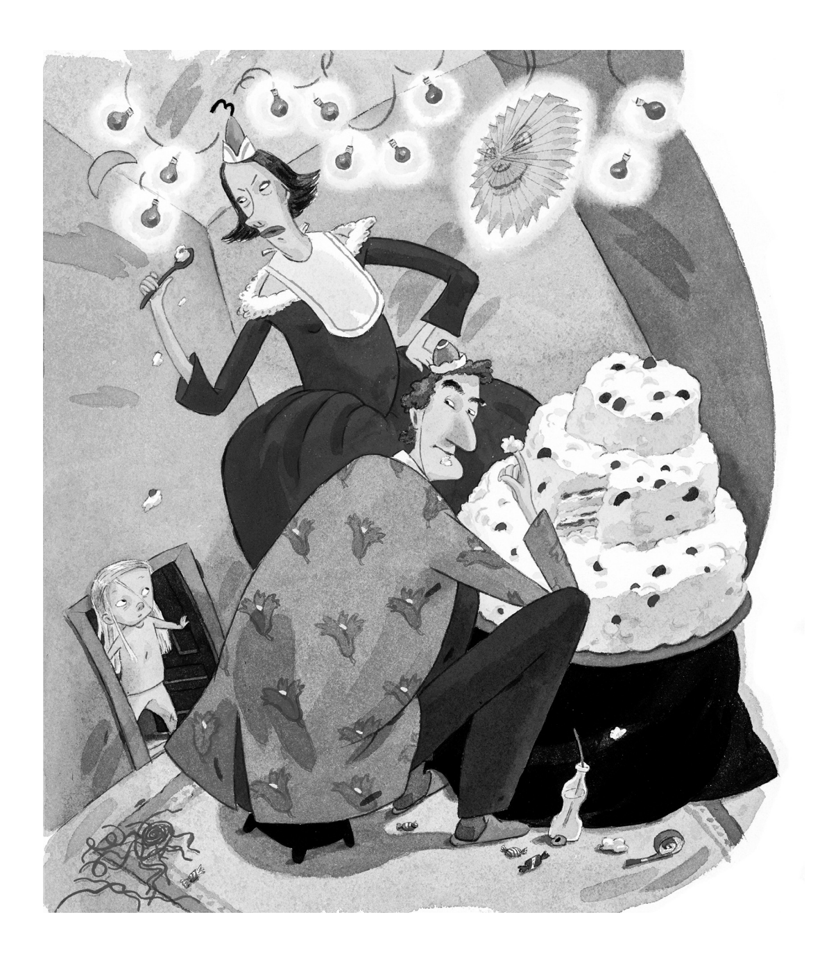
Fig. 3 A nightmare in pink? During the night, Cerisia's parents consume huge, overindulgent sweets in a dreamlike vision in Siv Sleeps Astray.