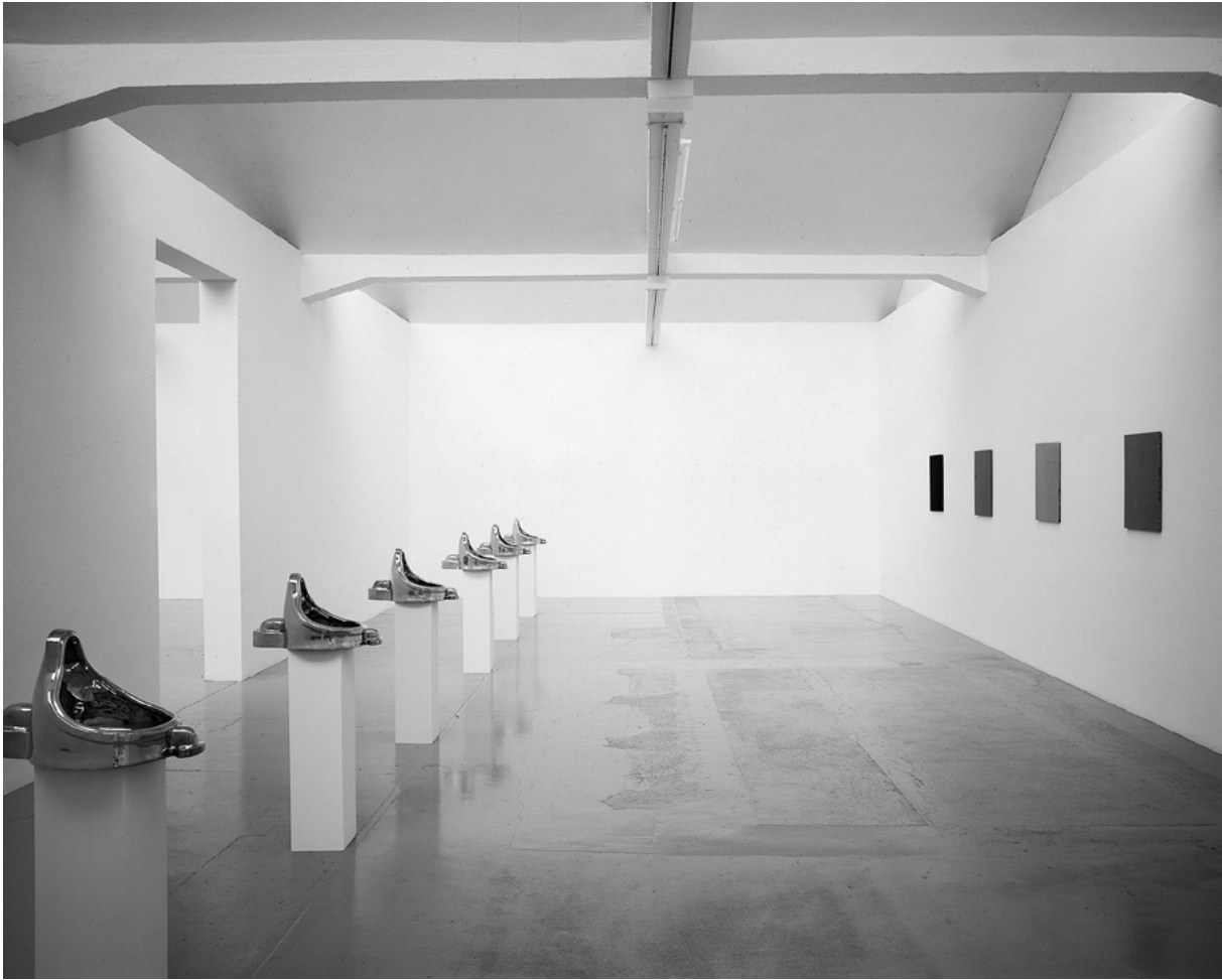
Fig. 6.6 Sherry Levine, Fountain (After Duchamp) , 1991 (sometimes titled Fountain [Madonna] ). Installation View, Sherrrie Levine, Kunsthalle Zürich, 1991.