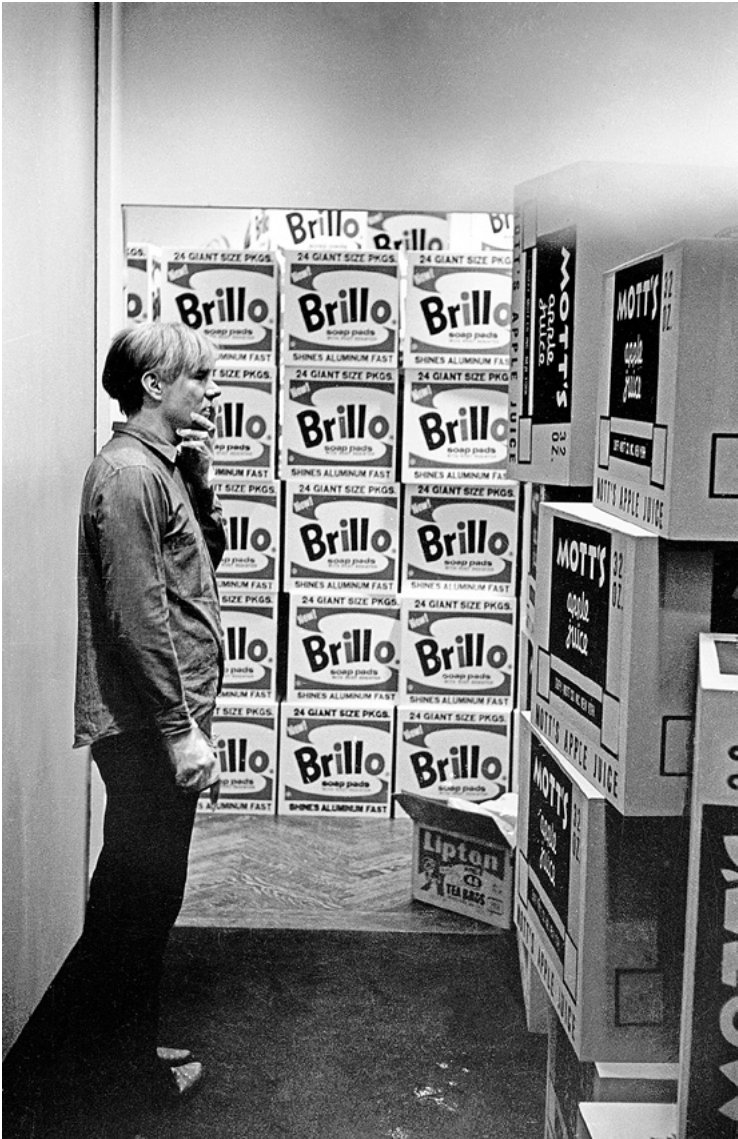
Fig. 6.5 Andy Warhol, Brillo Boxes , 1964.