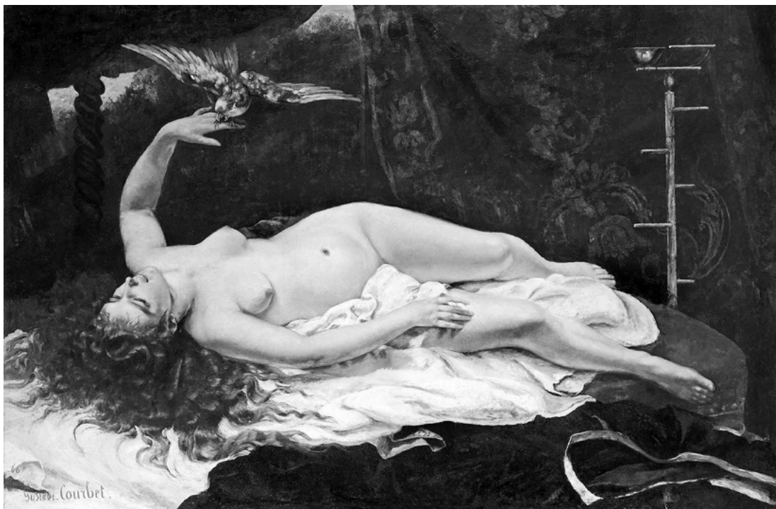
Fig. 2.5 Gustave Courbet, Woman with a Parrot , 1866. Oil on canvas, 129.5 × 195.6 cm. New York, The Metropolitan Museum of Art, H. O. Havemeyer Collection, Bequest of Mrs. H. O. Havemeyer, 1929.