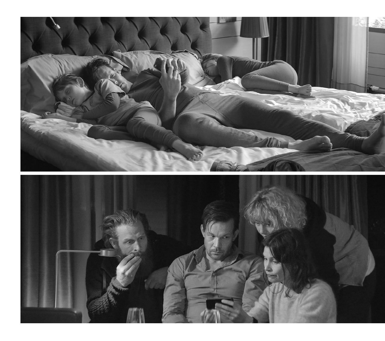
Fig. 2 (Force Majeure, 0.09.21)