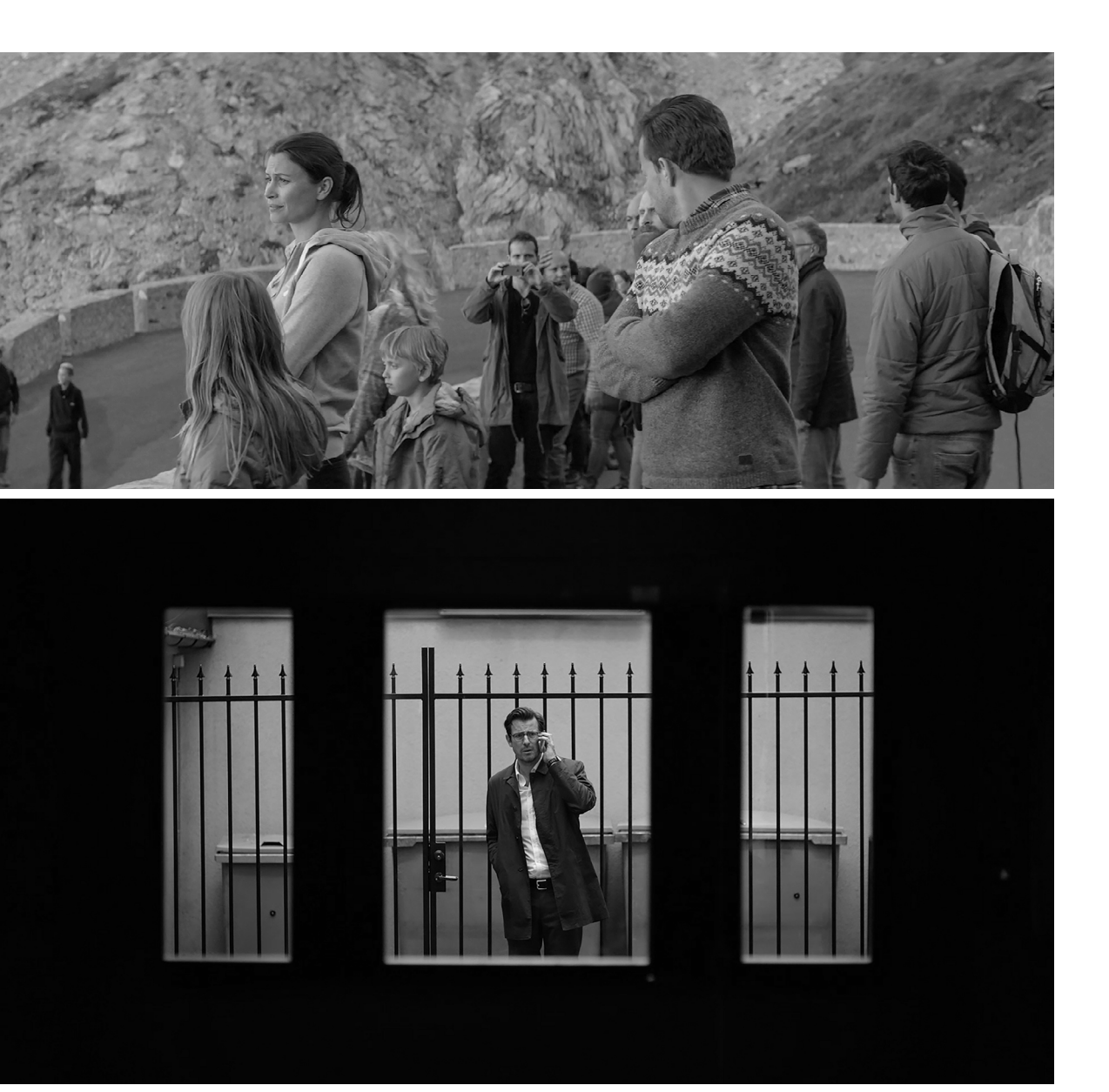
Fig 4 (Force Majeure, 1.54.40)