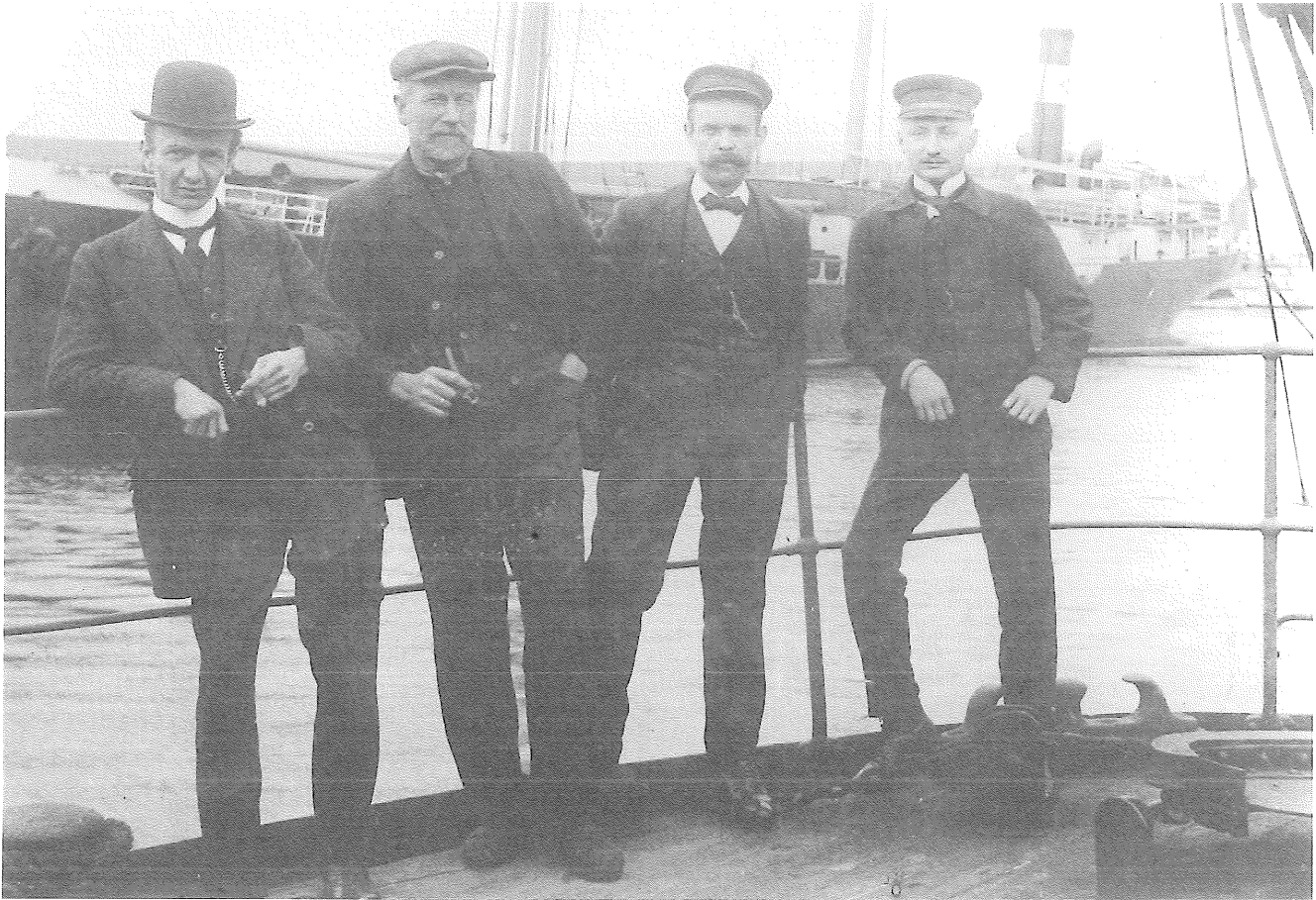
Besætningsmedlemmer om bord i S/S CARLA, bygget i Tønning 1899 til D/S Nordby/Fanø A/S. 1912 solgt til Genua, udgået 1926-1927. Foto 1912. Crew members aboard the S/S CARLA, built in Tønning in 1899 for the shipping company D/S Nordby/Fanø A/S. In 1912 it was sold to Genua and went out of service in 1926-27. Photo 1912.