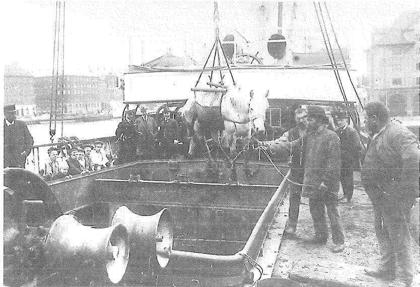
Der lodses heste fra S/S HELGE. I baggrunden Asiatic Kompagnis pakhus opført 1750. Pakhuset ses her med sin oprindelige gavl, så billedet er taget før 1918, da bygningen blev forkortet i forbindelse med udvidelse af havneløbet. Horses being unloaded from the S/S HELGE. In the background is the Danish Asiatic Company's warehouse, which was erected in 1750. It is photographed here with its original gable, so the picture must have been taken before 1918 when the building was shortened during the extension of the harbour.