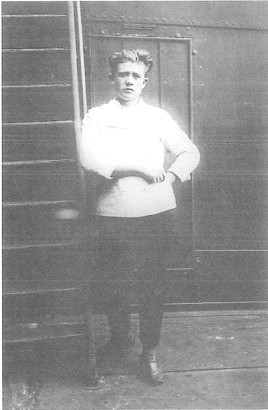
Messedreng ombord i S/S DANSBORG af København fra rederiet D/S Neptun/C.K. Hansen. Bygget i Blyth 1904, torpederet 22. december 1916 i fart mellem England og Portugal, hele besætningen reddet. Cabin boy aboard the S/S DANSBORG of Copenhagen from the shipping company D/S Neptun/C.K. Hansen. Built in Blyth in 1904, it was torpedoed on December 22nd 1916 while sailing from England to Portugal. All the crew members were saved.