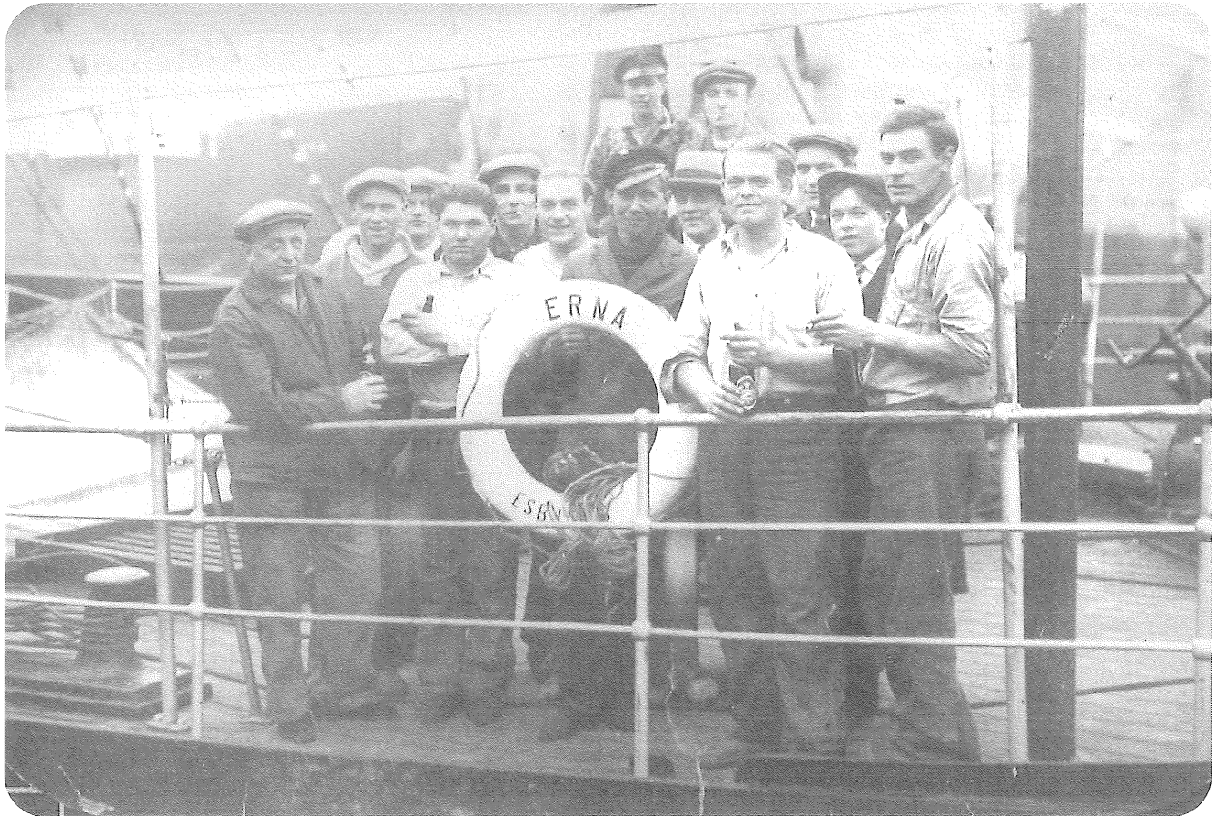
Besætningsmedlemmer om bord i S/S ERNA af Esbjerg, bygget på Helsingør Væft 1930 til D/S Vesterhavet (J. Lauritzen). Efter besættelsen april 1940 kom skibet i engelsk tjeneste, og 21. september 1941 i konvoj mellem England og USA blev det torpederet. 16 danske søfolk omkom. Crew members aboard the S/S ERNA of Esbjerg, built at Elsinore Shipyard in 1930 for the shipping company D/S Vesterhavet (J. Lauritzen). After the occupation of Denmark in April 1940 the ship went into British service. On September 21st 1941 it was torpedoed while sailing in convoy between England and the USA, and 16 Danish sailors died.