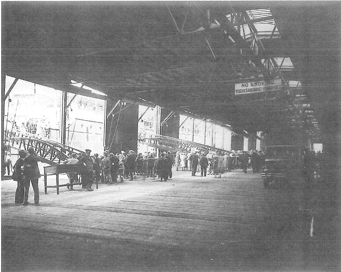
Afgang fra New York med S/S HELLIG OLAV, bygget Glasgow 1903 til det DFDS ejede Skandinavien-Amerika Linjen. The S/S HELLIG OLAV about to depart from New York. It was built in Glasgow in 1903 for the Scandinavia-America Line, which was owned by DFDS.