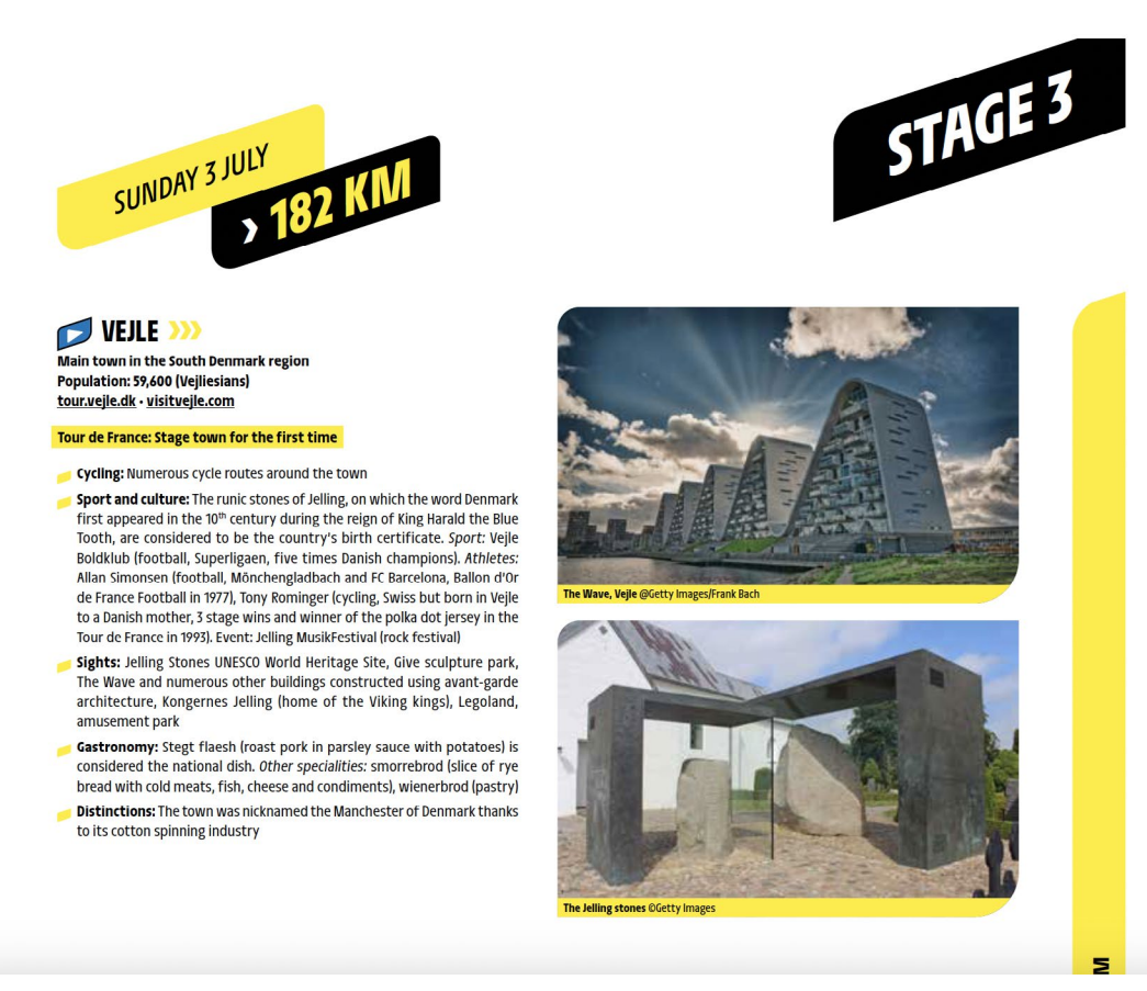
Figure 1. Excerpt from the Roadbook 2022. Page 43 with touristic information on the start city of day three, Vejle, and the Jelling Stone UNESCO World Heritage site

Planning the route is an important part of the preproduction process of the Tour de France, and, consequently, the final decision of the route stays with ASO. As part of that process, ASO made changes to both the route and organization at an early stage. They saw a lot of potential in combining the competition with the spectacular televisual qualities of crossing the Great Belt Bridge, and they insisted on having the finish line right after the bridge. This implied that one of the initial municipalities behind the bid, Odense, had to be replaced by the municipality of Nyborg. The top management of ASO visited Denmark a couple of times to experience and approve the route. For the local planners, considerations regarding the possible competitive impact of the weather and terrain were combined with strong genre-based knowledge about how landscapes and buildings/constructions have become increasingly important in television production (Frandsen, 2023),