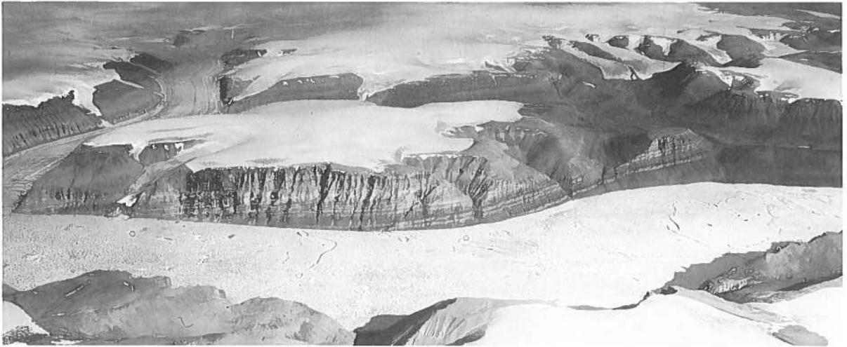
Fig. 3. View eastward across J. P. Koch Fjord showing Gustav Holm Dal between the two ice caps in the middle distance. Perssuaq Gletscher lies to the left. The cliffs along J. P. Koch Fjord are in excess of 1 km high and exhibit a mainly carbonate sequence extending from the Lower Cambrian to the Middle Ordovician.