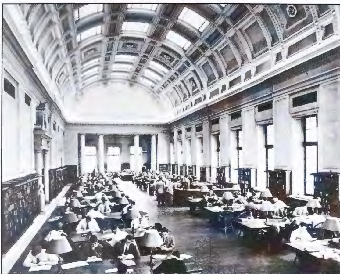
One of the main reading rooms at the Widener Library at Harvard University.

impossible for physical objects to be in several places at once. The traditional catalogue reflects this truism. So did the Luther shelves in front of which I was able to place my chair.