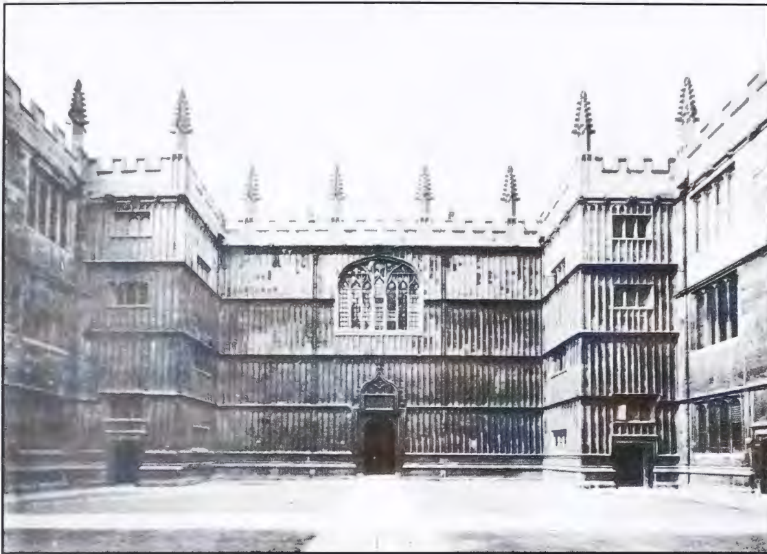
Bodleian Library, Oxford.

stand out and become visible among the enormous amount of information foisted upon us from everywhere.