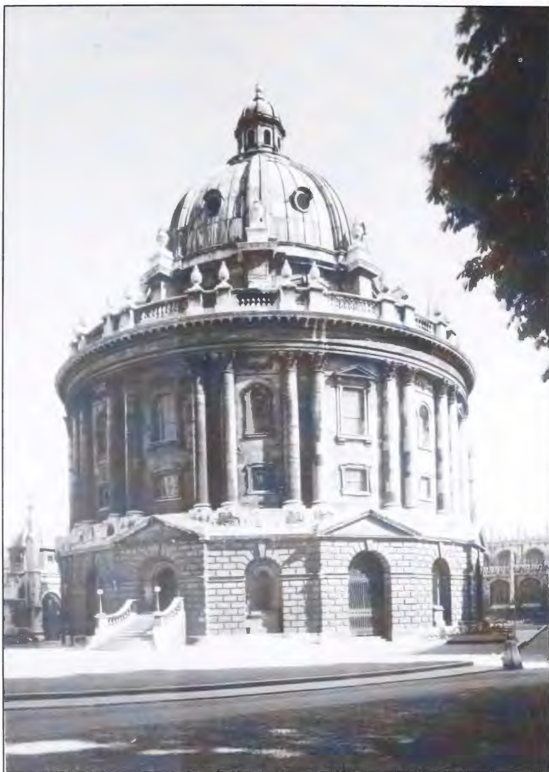
The Radcliffe Camera, Oxford. It forms part of the library and stands close to the „Tower of the Five Schools.“ (Foto: Det Kongelige Bibliotek, Billedsamlingen).