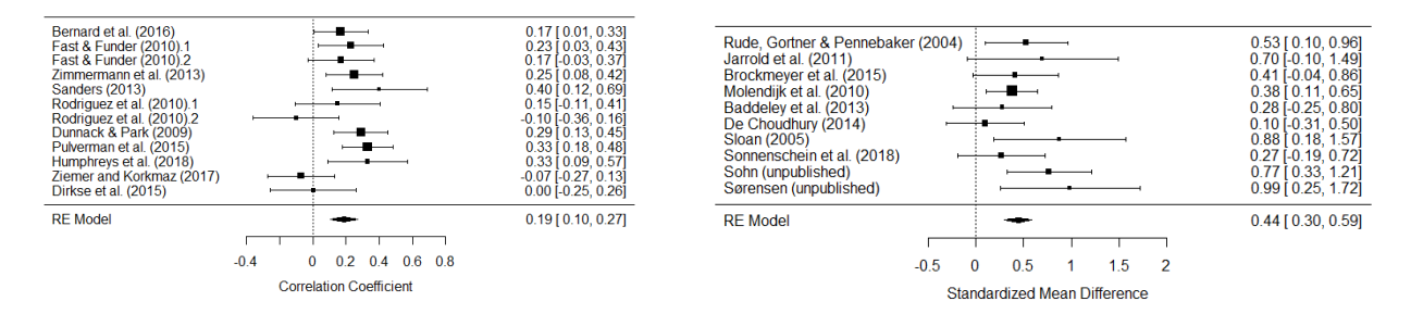
Figure 1. Forrest plots of effect sizes (Cohen's d and Pearson's r) in use of first-person singular pronouns. The x-axis reports the effect size (positive values indicate larger use of first-person singular pronouns in depression, while negative indicate lower use). The y-axis reports the studies for which statistical estimates of use of first-person singular pronouns were provided.