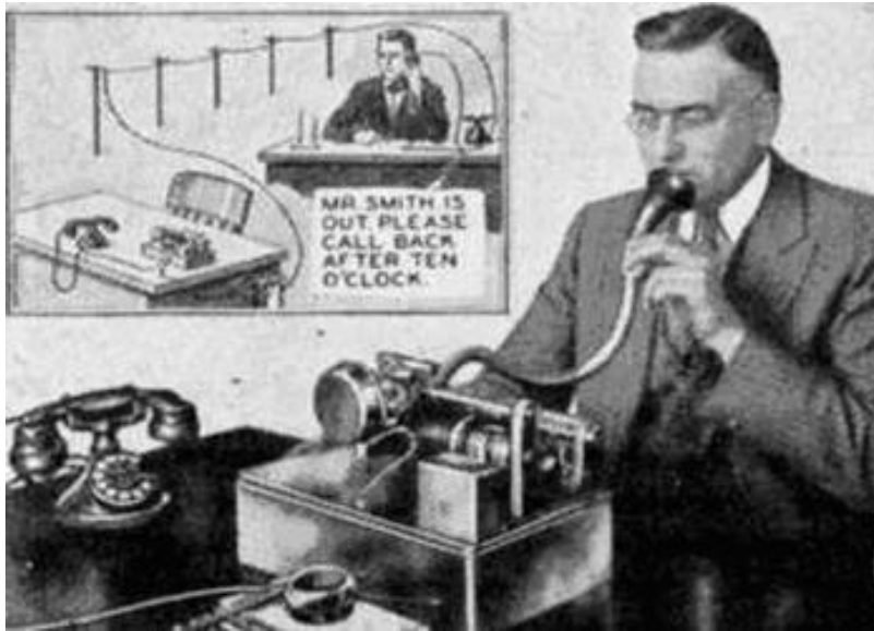
Early answering machine designed for business use

By the end of the twentieth century, landline telephony incorporated a host of additional control mechanisms: caller ID, call waiting, call forwarding, speaker phones. These features (and more) also became part of mobile phone technologies. Meanwhile, developments in computing added control options for both individuals and organizations. Ordinary citizens gained access (e.g., via email) to people who would never have accepted their telephone calls. At the same time, managers could now track the work habits and even the whereabouts of employees.