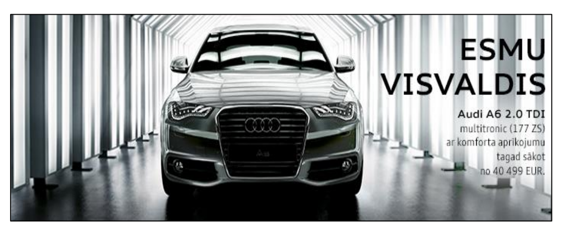
Figure 4: Visvaldi—a Latvian Audi A6 web advertisement supporting the poster ad

Third, modern knowledge transfer was coupled with the knowledge of the nation's history, where Latvia has strong links with Germany, thus rooting the advertised German car in the Latvian culture. But what makes the car truly Latvian is its fourth social context, by which the same idea of superiority is transferred as the knowledge code, but is represented with the cultural code congruent with the Latvian tradition to celebrate name days (the name day of Visvaldis is celebrated in spring—at the time of the campaign). This knowledge representation helped make the advertisement even more appealing. The text travelled by intricately interweaving the contexts, traditions and creating a new value for the advertised car in Latvia.