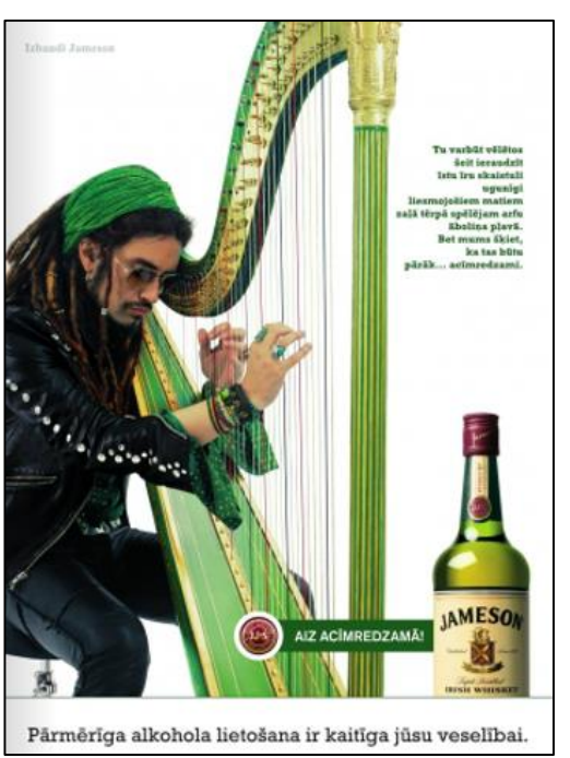
Figure 1: The Irish and Latvian adverts for Jameson Whiskey