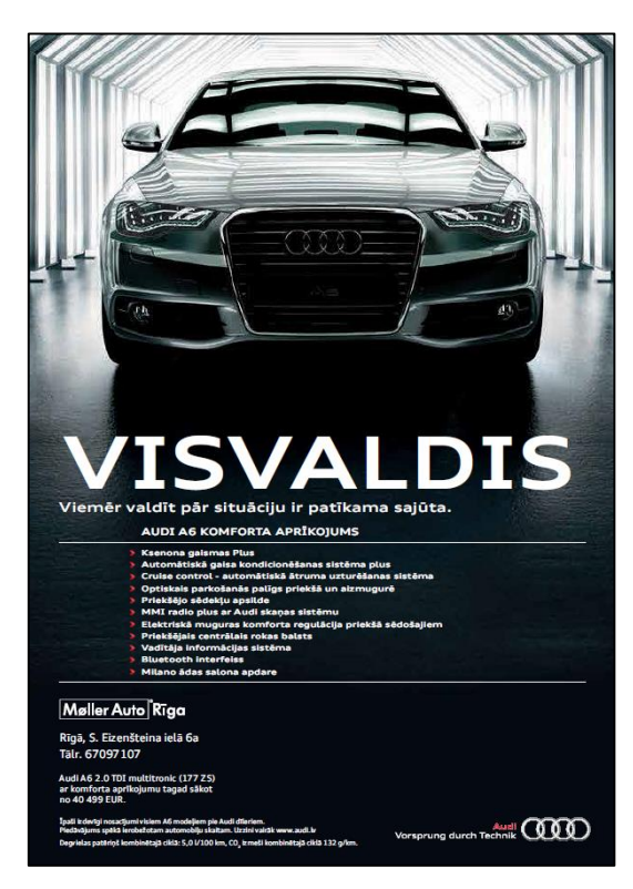
Figure 3: Visvaldi—a Latvian Audi A6 poster

We analysed posters in the streets of Riga, the capital of Latvia. We looked into their connection with the whole marketing campaign, in which a complete set of knowledge elements was necessary for realizing the text travel and revealing the encoded meaning.