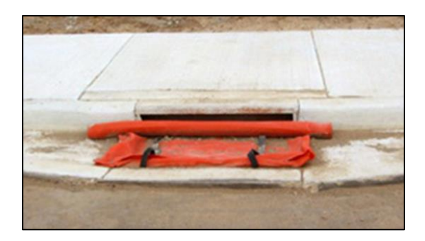
Figure 6: Catch basin for erosion control maintenance

placere en beskyttende, såkaldt "vandafløbspose", ved åbningen til vandafløbsrøret. The back translation would read like this. In order to protect the existing rainwater sewer system, the protection, a so-called "water-drainage bag", must be placed at the inlet to the pipe line. The underlined parts have shifted the focus from something generally known to something new, emphasized by so-called and with the term for water-drainage bag in quotes to introduce the term in the target culture. Note also, that in the back translation, the changed semantic description of the product is much more detailed in its knowledge reference. The shift from catch basin to waterdrainage bag is a shift from one knowledge representation to another, although with the same semantic effect. The shift from basin to bag is also a shift made possible by having access to the picture of the product, and the design is more in focus in the Danish language than in the English expression. The language in general is made to travel by rephrasing the knowledge representation from given knowledge to new knowledge, but apart from the product term, most of the semantic and pragmatic references can be kept. Semiotically, we face a different story. Figure 6 shows the device.