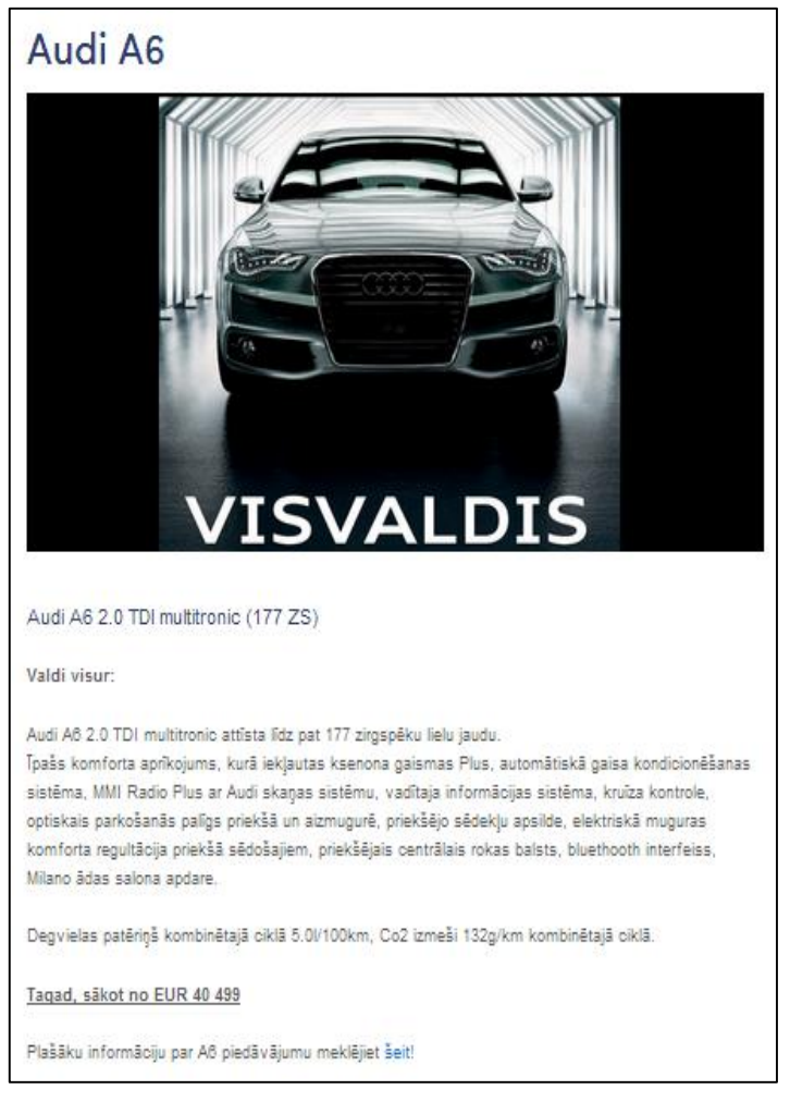
Figure 5 Visvaldis - webpage featuring detailed information about the Audi A6

The text without its graphic, semiotic references as a radio advert would create a rather silly statement of one's power and strength. Only coupled with the picture of the car and the textual elements did the campaign reveal the intended message, so the simultaneous travel of audio and visual genres contributed to the success of especially the audio text. The posters had the additional function of adding more detailed information about the technical specifications of the car, as shown in figure 5.