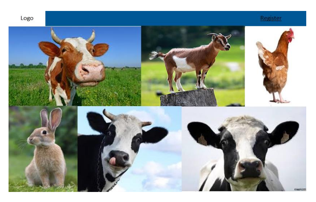
Figure 2 Bible OL App login Screen

The Bible OL App will have a user-friendly login-screen, which is designed for the needs of African students with a picture- and emoji-based login. The idea here is simple: Instead of typing in their user names and their passwords, the users of the system see a login screen in their aps as in figure 2 below