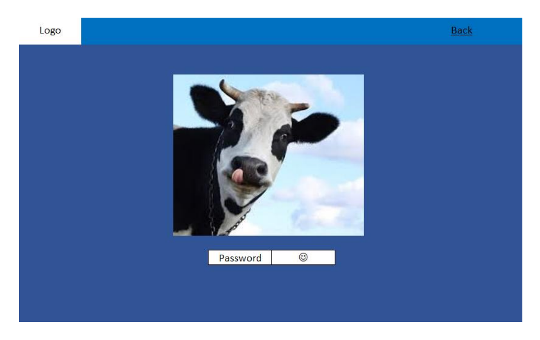
Figure 3 Bible OL Login

By simply clicking on their picture login the users receive access to the e-learning app. For their further identification they can use an emoji, which they might remember easily for logging on the system.