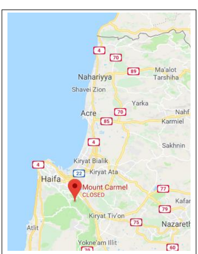
Figure 4. Google Maps showing the location of Mount Carmel. (The word "CLOSED" indicates that the tourist site is not currently open to the public.)

Linking from a Lexeme to a URL is also useful for linking to lexical or morphological information about a word.