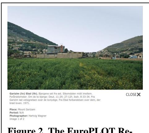
Figure 2. The EuroPLOT Resources showing a photo of Mount Gerizim and Mount Ebal, mentioned in Deut 11:29.

Deuteronomy 11:29 reads "... you shall set the blessing on Mount Gerizim and the curse on Mount Ebal." The photo shows Mount Gerizim and Mount Ebal.