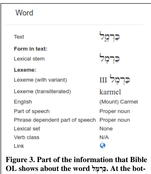
tom, a hyperlink with a globe icon can be seen.

icon showing a small globe. This indicates a map reference, and if the user clicks on the globe, the web browser will show the location of Mount Carmel in Google Maps (Figure 4).