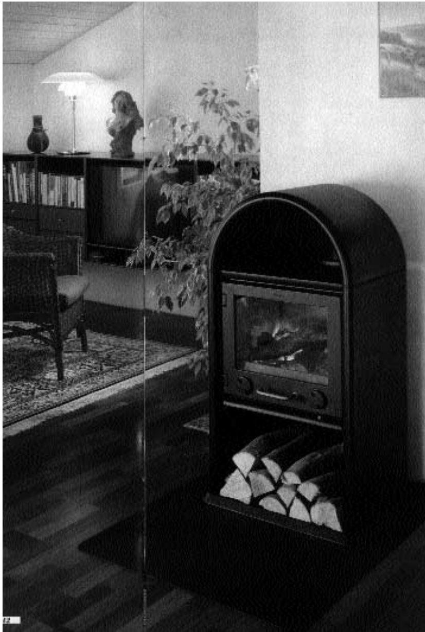
Figure 2: A Danish-style home, standard brochure