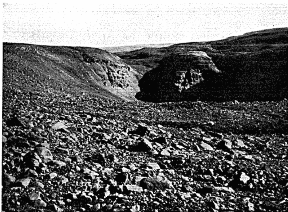
High arctic desert in the interior Heilprin Land, Peary Land.

the climate and erosion. In 1946 extensive botanical investigations were carried out in the area at Søndre Strømfjord under the leadership of Tyge W. Bøcher (1949, 1949 a). The vast deserts areas in Peary Land was discovered during the Danish Pearyland Expedition 1947—50, and informations have been given in the provisional reports made by the expedition (Fristrup 1949, 1951, 1952 and Eigil Knuth 1952).