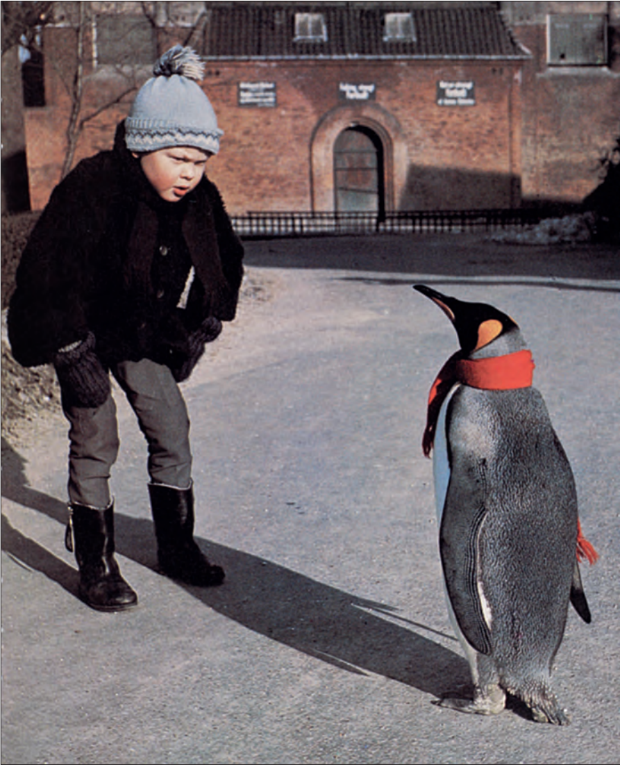
Ill. 5: In Ivar Myrhøj's Pingvinen Pondus (Pondus the penguin) from 1966 a boy asks Pondus: "Are you human or an animal?" Pondus answers "I am a penguin," but goes on speaking to the children, telling them about his life and family. The text humanizes the animal on the photograph, but one can say it works the other way around as well: the staging of the penguin on the photograph also gives us an impression of a person speaking rather than an animal.