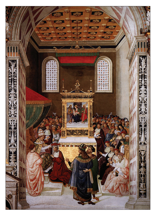
the cardinal's hat on Enea Silvio Piccolomini, 17 December 1456. One of a series of fresces by Pintoricchio in the Libreria