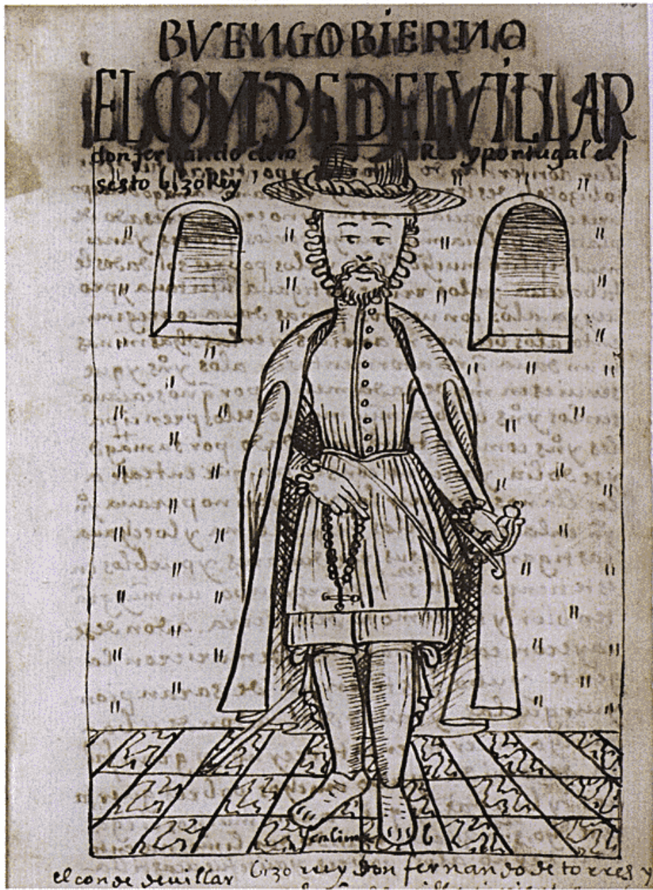
Figure 10: The portrait of Don Fernando de Torres y Portugal, Count of Villar, the seventh viceroy of Peru, was added after the insertion of that of the marquis of Montesclaros, the eleventh viceroy. It resulted in Guaman Poma's correction of subsequent viceroys' ordinal ranking (actual page 466; see Figure 8).