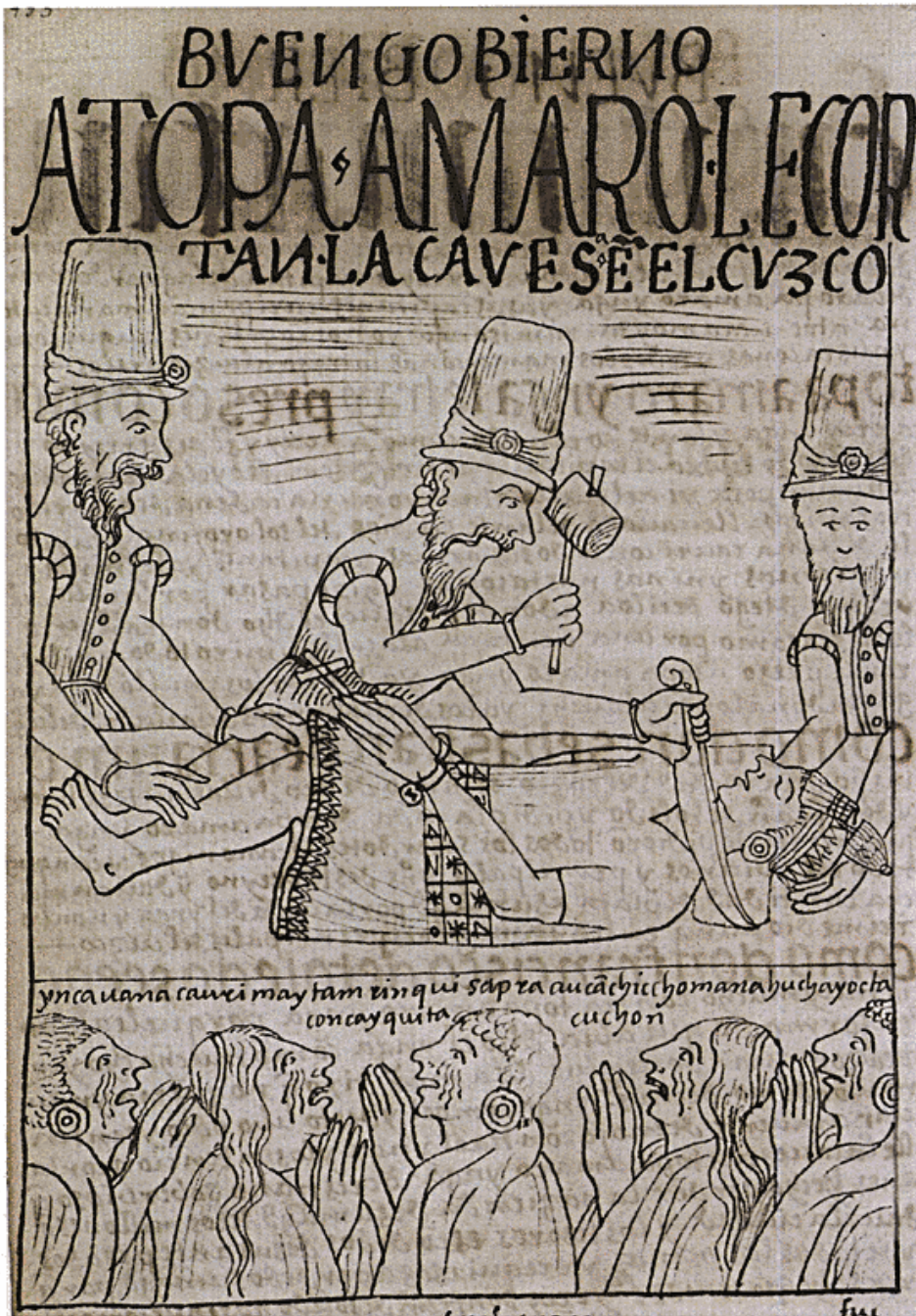
Figure 13: Guaman Poma portrays the execution of the prince Tupac Amaru Inka by order of the Viceroy Toledo as if he had witnessed the event (actual page 453).