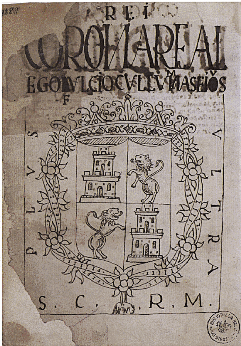
Figure 12: “Ego fulcio columnas eius” (“I fortify its columns”): the coat of arms of the Spanish crown that graces the last page of the manuscript (actual page 1189).