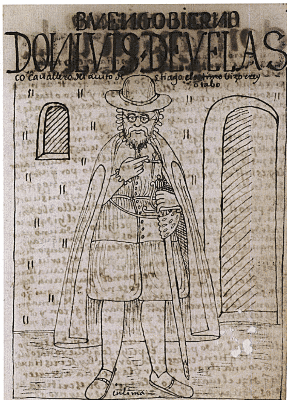
Figure 14: Guaman Poma depicts Don Luis de Velasco as the eighth viceroy of Peru (he was actually the ninth), with the personalized feature of eye glasses (actual page 470).