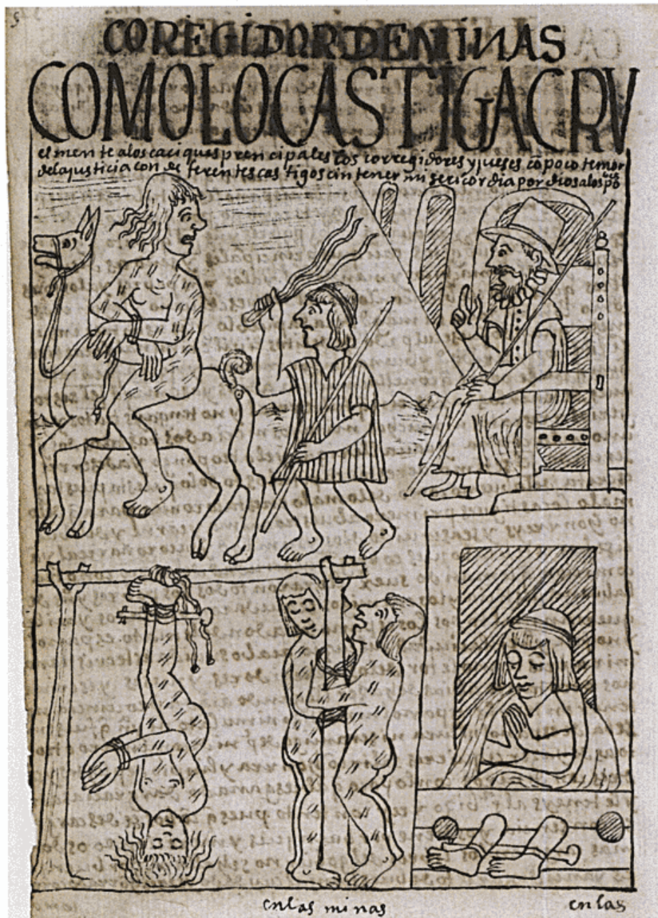
Figure 16: Corregidor de minas : The administrator of the royal mines punishes native lords. This pictorial account underscores Guaman Poma's concern for abuses of native lords and laborers in the mines (actual page 529).