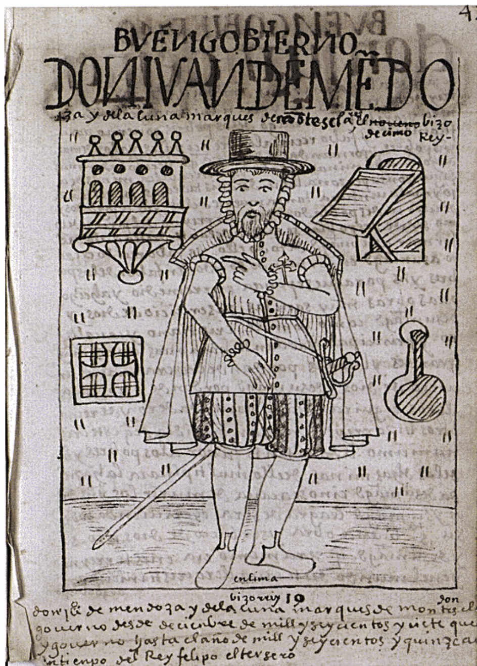
Figure 8: This portrait of Don Juan de Mendoza y Luna, marquis of Montesclaros was inserted after the manuscript was sewn. Added at a still later stage is the footnote that he governed "until the year of 1615 in the time of Philip III" (actual page 474).